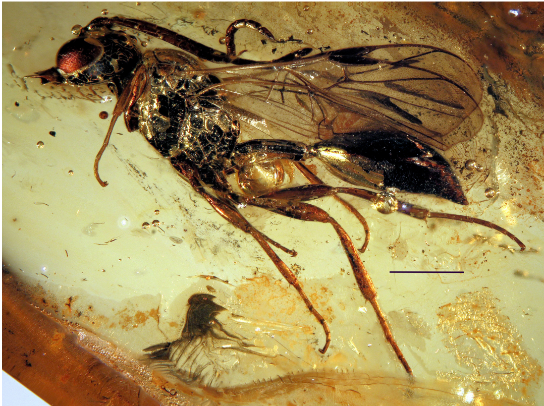
FIGURE 1. Helorus arturi sp. nov. Holotype, lateral view. Scale bar = 1 mm.

Locality and horizon. Eocene deposits, age 40–50 Ma (Weitschat & Wichard, 2008).