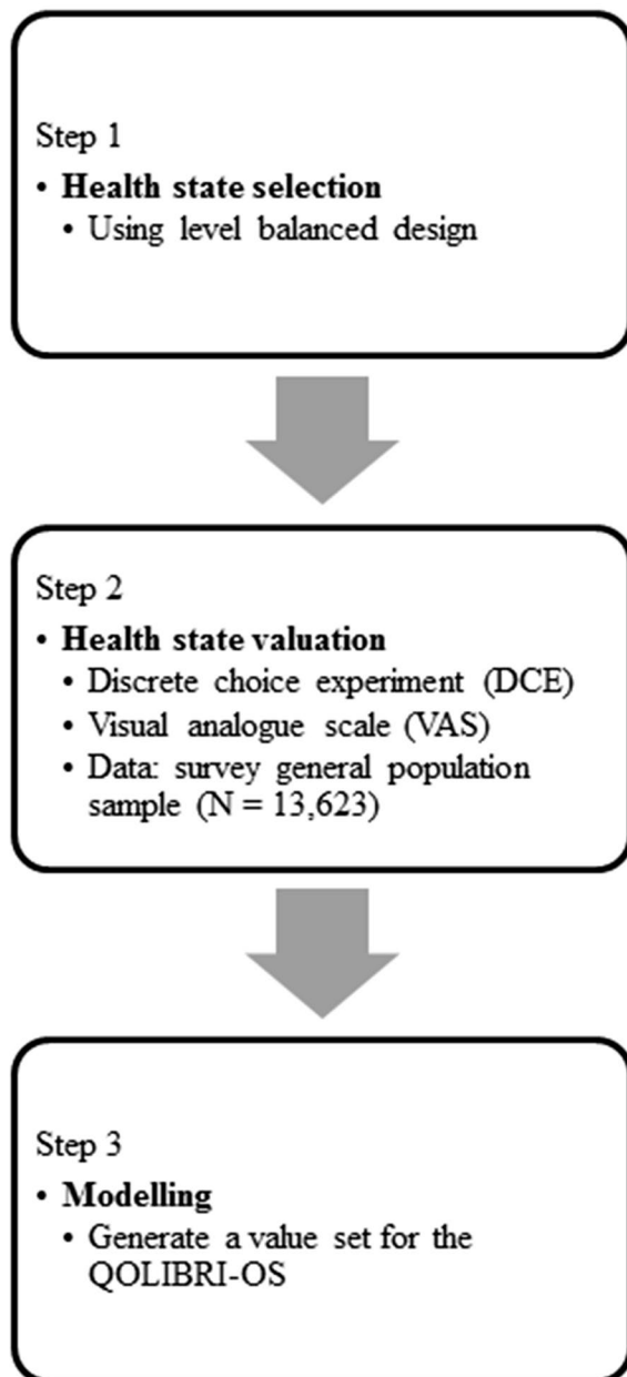
Fig. 1 Steps taken to yield a QOLIBRI-OS value set which enables calculation of utility weights for the health states measured with this instrument. QOLIBRI Quality of Life after Brain Injury, QOLIBRI-OS Quality of Life after Brain Injury Overall Scale