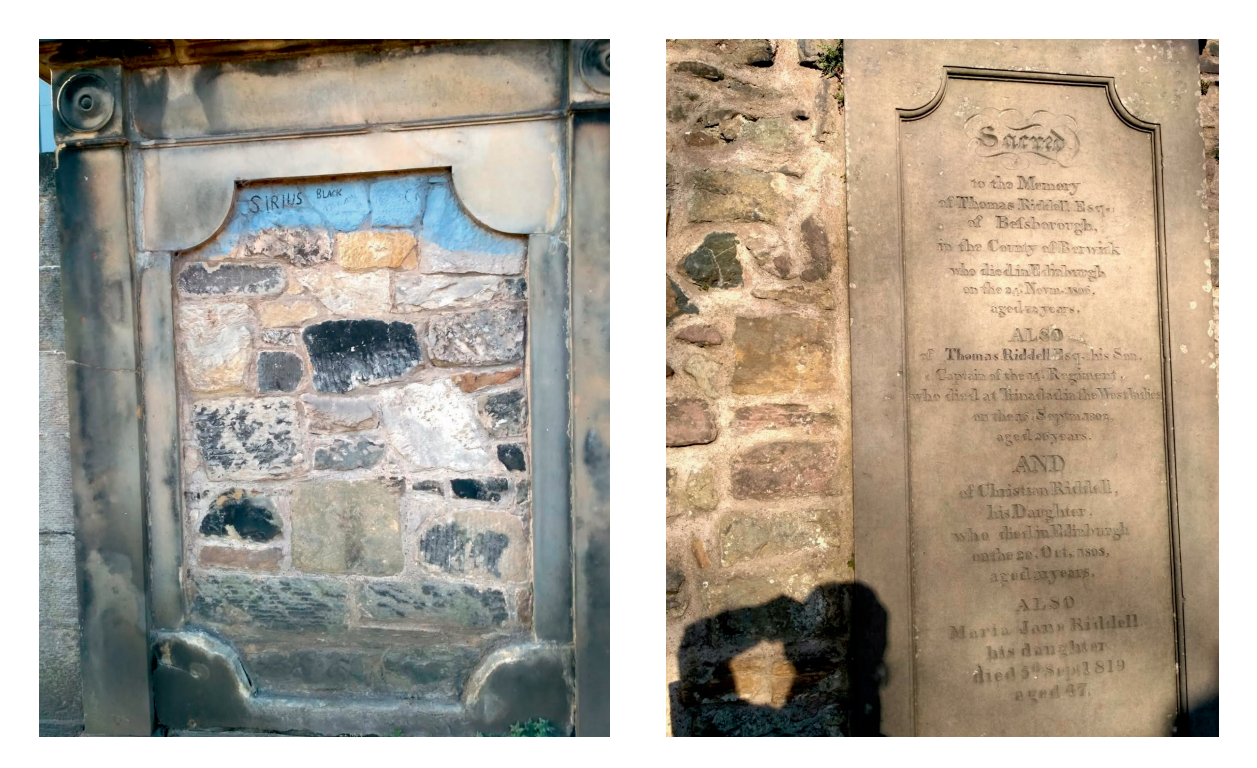
Figure 0.2. a) A burial stone at the Greyfriars Kirkyard, Edinburgh with the name Sirius Black written on it to commemorate a character from the Harry Potter books and b) another one with the name of Thomas Riddell, who is commemorated as Thomas Riddle aka Lord Voldemort from the same book series. (Photographs: T. Äikäs, 2019.)