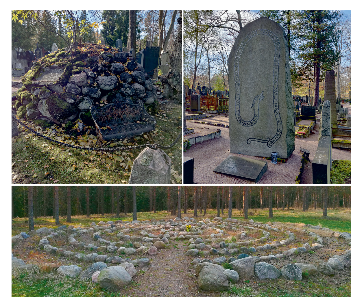
Figure 0.1. a–b) 19th-century tombstones resembling prehistoric monuments and c) a pet memorial in Turku resembling a Troy Town (Fi jatulintarha, Sw jungfrudans).

In contemporary society, which is often described as secularized and rootless, neo-spirituality, heritagization, and a connection to past traditions are ways to create meaningful relations to the past (see also Papastephanou 2018; Ribberink et al. 2018; Possamai 2019). In Sweden, Howard Williams (2011a, 2012; see also Back Danielsson 2011) has noted that contemporary memory groves make references to prehistory and to historical times both in their use of material culture and their location in the landscape. Some references take their form from an archaeological relic whereas others reuse old monuments, such as 19th-century stone and iron memorials. Some of the references seem to have been made by design, such as pseudo-runic inscriptions, whereas others are more subtle and may be involuntary. This has also been shown to be the case at the cemetery in Kirkkonummi, Southern Finland, where the planning of the memorial structure makes several references to archaeological remains such as Stonehenge (Ikäheimo 2011; Ikäheimo & Äikäs 2017). In addition to Kirkkonummi, the same phenomenon is present also at the cemetery of Hietaniemi, Southern Finland, where 19th-century tombstones resemble Bronze Age cairns or Viking Age rune stones, and even at some contemporary pet cemeteries (Figure 0.1).