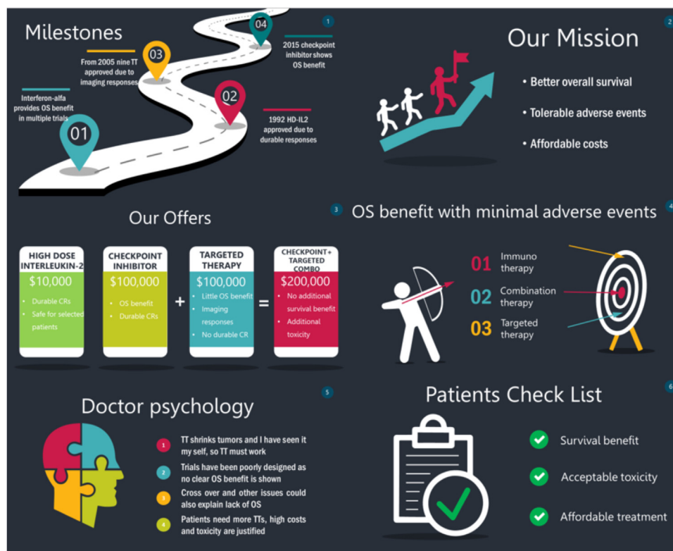
Fig. 1 – Infographics of mRCC treatments. CR = complete response; HD-IL2 = high-dose interleukin-2; mRCC = metastatic renal cell carcinoma; OS = overall survival; TT = targeted therapy.

In this review, we have evaluated the OS data of the treatments approved for mRCC. We question whether drug approvals granted based on overall response rate and PFS responses without OS benefit still make sense in 2020, given the dramatic accelerated changes in the therapeutic landscape in the last years. We mainly focused on differences between IT and TT. Treatments were divided into ITs or TTs according to their main mechanism of action. ITs include interferon-alpha and interleukin-2 cytokines and modern checkpoint inhibitors (antibodies that specifically target the interaction between PD1/PD-L1 or block the CTLA-4 receptor in T cells). TTs refer to tyrosine kinase inhibitors or antibodies that target the vascular endothelial growth factor and related pathways, or mTOR inhibitors that affect cell growth factors and metabolism.