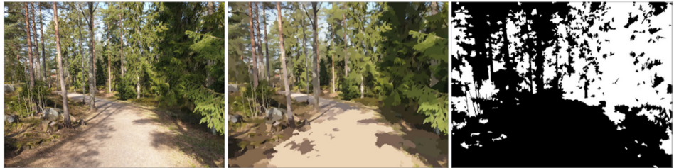
Fig. 2. A. Left: The original image. Middle: The segmented image Right: The final binary image in which the white areas represent vegetation. The GVI of this image is 38%. Note: The image is self-taken and it simulates here the copyrighted GSV images.

dataset (id, street name, road class, functional class, traffic direction, type of the street segment and binary cycleway column).