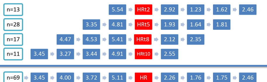
Figure 2 Overview of self-reported NRS pain score in past week for participants who received an HR, represented per time point when they received an HR. Left of the red box (= when HR is seen on radiograph) pain scores before HR with intervals of 2 or 3 years, and right of the red box the pain scores with HR. The last row represents the weighted average pain scores for all participants.

reported lower pain intensity (both on the NRS, -1.9 points after 10 years) and on the WOMAC subscale (-2.6 points after 10 years, in analysis without LOCF) and lower scores for physical function (-8.1 points on WOMAC physical function after 10 years, in analysis without LOCF) compared with baseline. Use of any pain medication after 10 years seemed to decrease in persons of the HR group and increased in the no-HR group. Regarding the physical examination results, we observed an increase in painful movements of the hip in participants of the HR group: painful internal rotation, external rotation and flexion of the hip are reported more frequently after 10 years compared with the baseline (online supplemental table S2). However, at T10, only a small number of participants underwent a physical examination in the HR group. Figure 2 shows the course of (hip) pain intensity over the past week, figure 3 the course of ROA and figure 4 the course of clinical hip OA in the years preceding the HR (for the HR group). We observed higher pain intensity for the past week before HR compared with the pain intensity during the follow-up with an HR (figure 2). The percentage with ROA increased in the years before the HR; only a small proportion of participants had severe ROA (19%–35% K/L 3 and 0% K/L 4 obtained from radiographs before HR) (figure 3). Most participants met the clinical hip OA criteria (69%–88%) before undergoing an HR (figure 4).