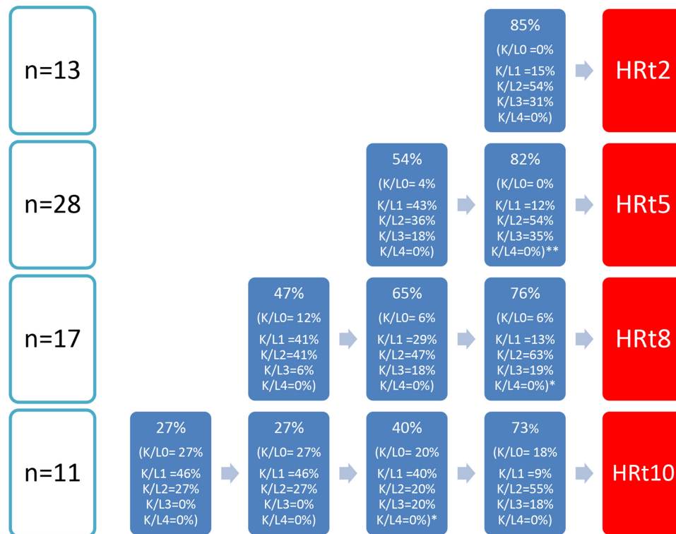
Figure 3 Overview of percentages of participants with radiographic hip OA according to Kellgren and Lawrence score \geq 2 and noted in brackets the highest Kellgren and Lawrence score of any hip in time intervals of 2 or 3 years before HR. * = 1 missing, ** = 2 missing.