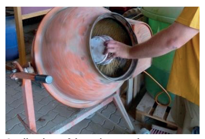
Application of inoculants using a cement mixer is common. The germination rate can be reduced due to physical damage. Larger quantities of seeds are usually inoculated with spraying pistols or mixers mounted on tractors.

There are marked differences between products that use the same or similar strains of rhizobium. Peat-based products (e.g., HiStick, LegumeFix) are regarded as standard inoculant products. They have the added advantage of colouring the treated seed. The use of polymer adhesives is particularly relevant for pneumatic seeding because pneumatic seeders tend to remove the inoculant from the seed.