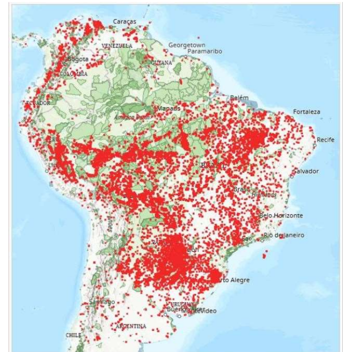
Waldbrände in Südamerika über drei Tage im August 2019 (24.-26.8.2019). Die roten Punkte geben nicht die reale Größe von Bränden wieder, sondern markieren Gitterzellen, in denen Feuer registriert wurden. Grün: Schutzgebiete.