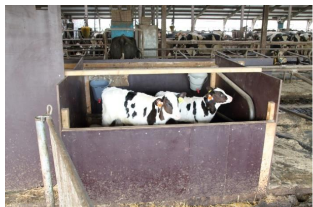
Fig 2. Calves reared in a crate and fed milk in a bucket at a Dutch research station. Dams can visit the crate, see hear and touch their calf.

Three types of access between dam and calf were observed at the farms visited for this report, and a fourth type of access is currently under trial at a