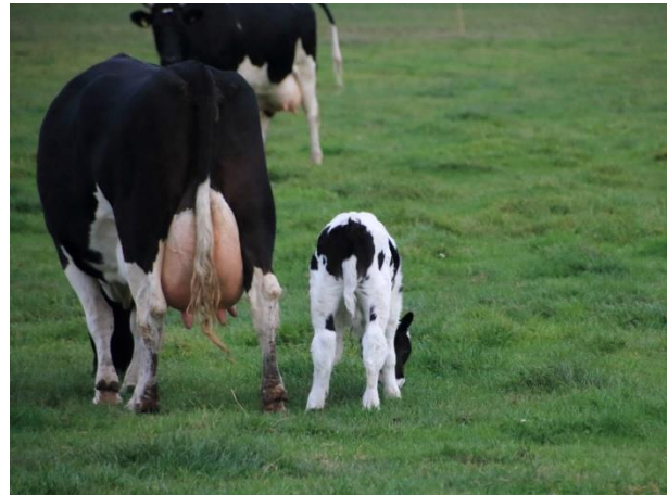
Fig 5. Dam-rearing has been practiced since 1991.

The farm is biodynamic with a herd of 60 Old Friesian dairy cows where calving occurs on pasture from April to October. Roughage is either grass silage or pasture, and lactating cows are supplemented with faba beans, oats, rye and grass pellets. Hence, calves have access to pasture and the same ration as cows, and they receive a concentrate after separation. The farm is integrated with a café and a bed & breakfast as well as a small pig production. Dam-rearing has been practiced since 1991.