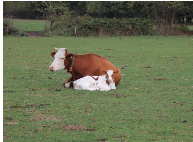
Fig 6. Cows and calves graze together outside.

The farm is organic with a herd of 60 cows of mixed breeds including Holstein-Friesian, Fleckvieh, Emmerij and Blaarkop. Cows graze the majority of the year unless the ground is very wet or covered with snow. Feeding is grass based with either pasture or grass silage, and cows are only supplemented with a mixed concentrate in early lactation. Calves are kept in the same group with all lactating cows until separation and move together both indoors and outdoors. Dam-rearing has been practiced since 1996.