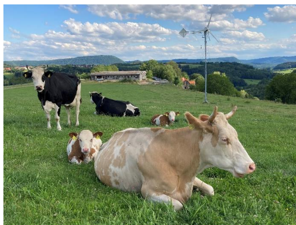
Fig 12. Calve and her dam on the pasture with other lactating cows.

Supplementation during grazing consists of hay and freshly cut forage legumes and grass. In winter, cows are fed with hay and grass silage. As long as the calves stay with their dams and nurses, they have access to the same feed as the lactating cows. After weaning at four months of age they either graze in summer or receive concentrate and high-quality hay in winter. Dam-rearing has been practiced since 2017.