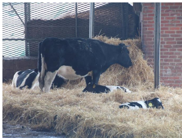
Fig 10. Cows and calves share a deep litter area.

The farm is organic with a herd of 30 cows of the old Holstein breed. All animals can graze throughout the year, and calvings are distributed all-year-round. All animals including calves reared by the dam are fed pasture, grass silage and vegetable scraps. Bull calves are raised on the farm until slaughter at 24 months of age. The farm is integrated with a vegetable production, a farm shop and a bed and breakfast. Dam-rearing has been practiced since 2015.