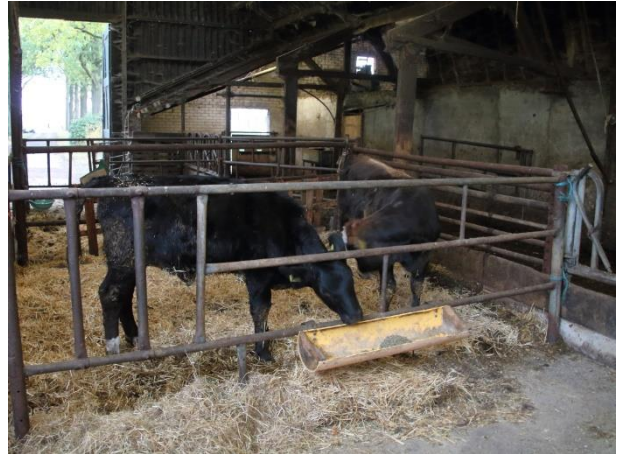
Fig 8. A separate pen with a flexible barrier adjacent to the lactating cows is used for gradual separation.

The farm is biodynamic with mixed herd of 50 cross-bred cows that include Holstein-Friesian, Friesian, Jersey, Brown Swiss and Emmerij. Cows graze the majority of year and are fed grass and maize silage as well as a mix of peas and barley in a feeding box and a mixed concentrate in the parlour. Calves are fed silage and concentrates during the partial separation process. Calvings are distributed throughout the year, and dam-rearing has been practiced since 2007.