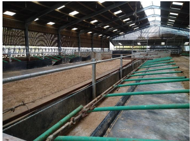
Fig 4. Only calves have access to a separate area in the center of the cow barn.

The farm is organic with a herd of 130 Holstein x Montbéliard x Swedish Red crossbred cows that are split in two stable groups where one group calves in February/March and the other group calves in October/November. The two groups graze separately. Beside pasture, cows receive lucerne pellets in the parlour in addition to grass silage in the feed bunk. Calves have access to silage and pasture once they enter the group of lactating cows. The farm focuses on self-sufficiency with feed and is integrated with its own cheese factory, farm shop and experience park. Dam-rearing has been practiced since 2016.