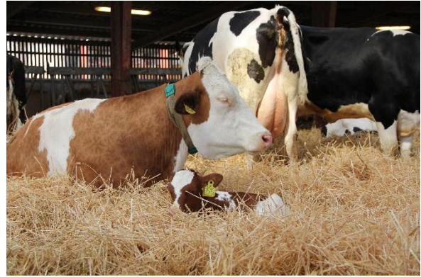
Fig 13. Calves with their dams in the barn.

The farm is an organic herd with 250 cross-bred cows that included Holstein-Friesian, Montbeliarde and Viking Red. Cows are fed a total mixed ration based on grass and maize silage as well as mixed concentrates. Cows graze during the summer and have access to an outdoor exercise area during winter. Calves are fed water and concentrates in a calf creep. Calvings are distributed throughout the year, and dam-rearing has been practiced since 2019.