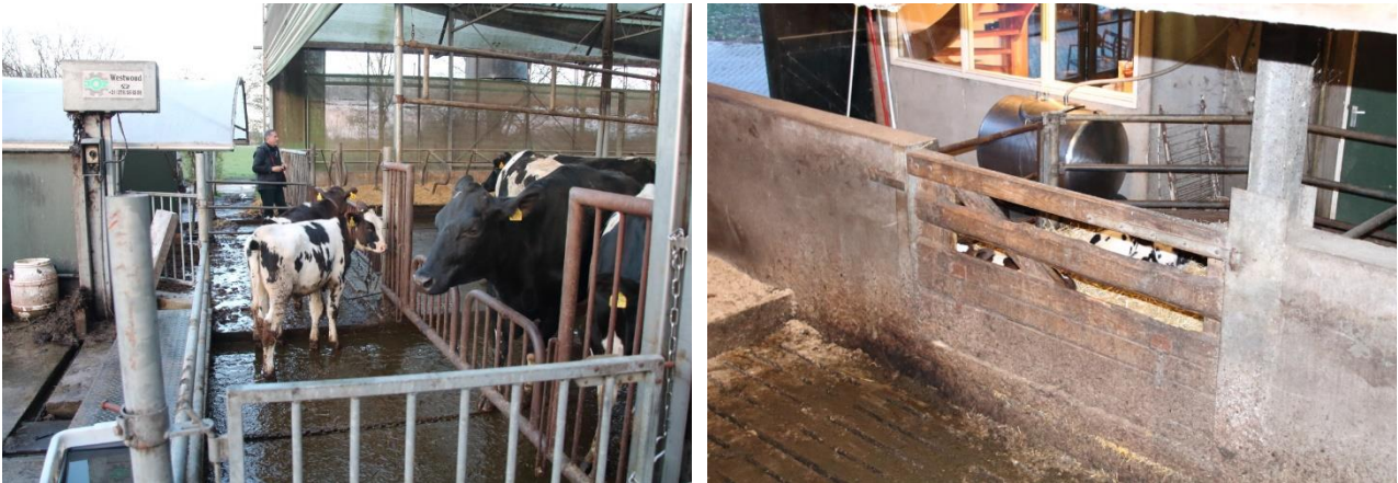
Figure 15. Two examples of setups where farmers could gradually separate cow and calf. In both cases, calves can reach the cow through a barrier that later can be blocked with a chain (left) or wood (right).

The final theme concerns the organisation of separation of the cow and calf, and this handled quite differently across farms. Figure 13 shows two examples from two farmers attempting to gradually restrict the amount of contact with barriers, but we do not yet know whether this is better or worse for the cow, the calf or both when compared with abrupt separation. Furthermore, the length of the dam-rearing period may influence what is best besides having a major effect on the physical organisation of the separation area.