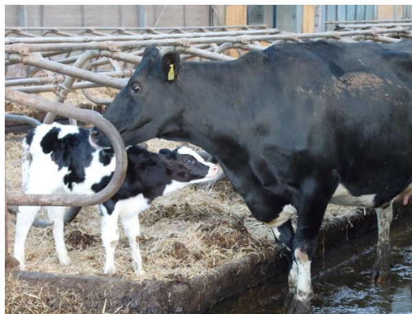
Fig 9. All cows and calves reared by their dam roam the cubicle barn.

Calves require attention from the farmer soon after calving as socialisation with humans does not happen on its own, but calm cows on this farm generally also produce calm calves. Grazing very young calves is not done as calves have previously run onto a nearby major highway. A separate pen for gradual separation and weaning and sufficient bonding time in a calving pen are key components.