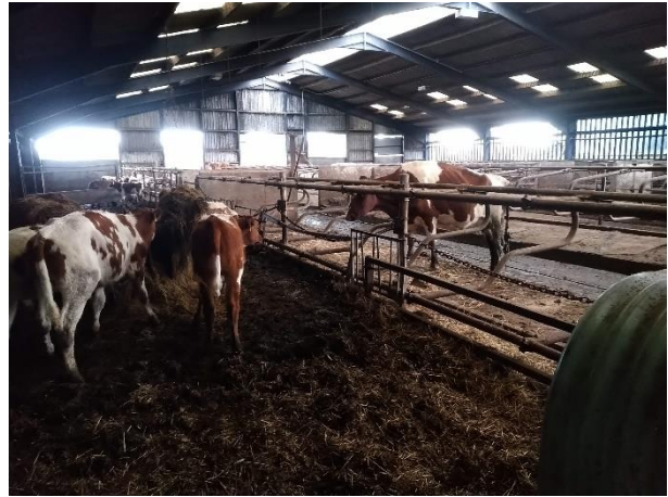
Fig 3. Calves and their dams have partial contact through a barrier at night.

The farm is organic with a herd of 55 Holstein x Ayrshire crossbred cows that calve within a 12-week window in spring. Cows graze as much as possible from April to October, and feeding consists of baled grass silage that occasionally is supplemented with either grass or lucerne pellets if silage quality is less than expected. Calves are offered baled grass silage from one week of age in a deep litter area separate from the cows. The farm has an overall focus on self-sufficiency with feed and holistic grazing and is integrated with its own milk processing and delivery service. Dam-rearing has been practiced since 2018.