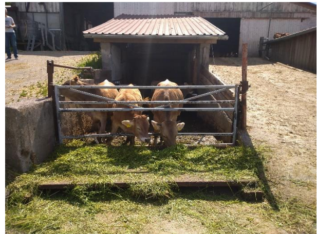
Fig 11. Newly separated calves are kept near where cows walk in and out of the barn.

The system needs to be flexible to handle that not all cows or all calves respond similarly to bonding, suckling and debonding. If the calf feels full, then separation is less of a problem for the calf compared with the dam, and the majority of times this goes well, albeit some cows will complain. This system needs sufficient space, and it can be challenging in winter if there is not enough space inside the barn.