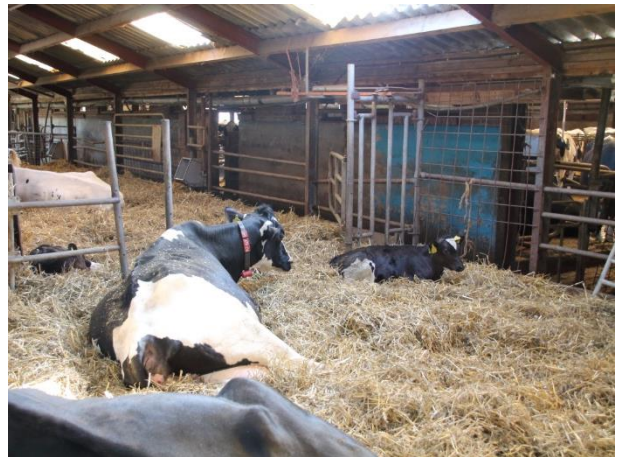
Fig 7. A smart gate (center) gives access to the milking robot.

The farm is conventional with a herd of 65 Holstein cows where calvings are distributed throughout the year. Grazing is practiced during summer where dams with their calves graze a separate area. All lactating cows are fed a mixed ration with maize and grass silage, soy and potato residues. Calves reared by the dam are fed a concentrate mixture in addition to suckling. Dam-rearing has been practiced since 2007. The farm is integrated with a cheese factory and a farm shop.