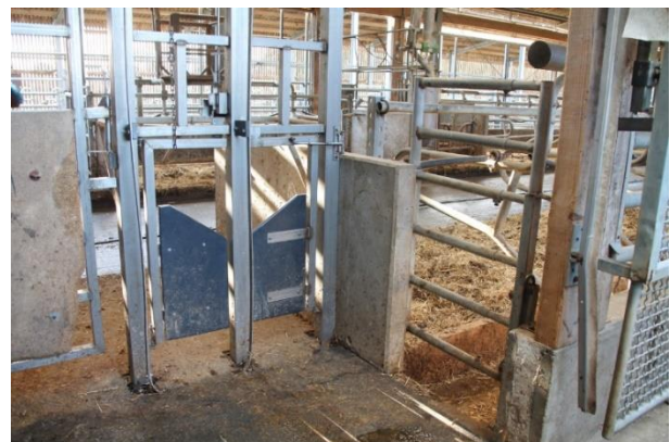
Fig 1. Electronic smart gates at the Thuenen Institute of Organic Farming in Trenthorst, Germany, control the access of calves to their dams.

The majority of farmers with a cow-calf contact system have developed these by modifying and adapting existing management practices and barn systems. Hence, very few farmers have a cow-calf contact system designed from the beginning to house cows with their calves during the weeks or months after calving. This report presents a variety of cow-calf contact systems developed in existing barns by European dairy farmers, who have been motivated to implement a cow-calf contact system and developed it from observations, experience and knowledge from literature, courses and colleagues. It serves as support for analyses in three current Danish research projects cow-calf contact systems at Aarhus University, and we furthermore hope this report can inspire prospective farmers, who are considering implementing a cow-calf contact system. Finally, our work has so far focused on systems where cows rear their own offspring, which is defined as a dam-calf contact system (7), but we have where relevant included information about foster cow rearing systems (7) and other cow-calf contact systems.