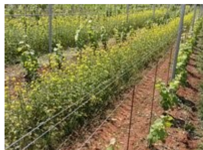
The inter-row space Brassica cover crops in June at the experimental vineyard plot