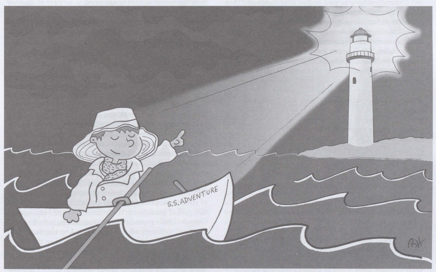
MRA "Lighting the Way for Literacy" • www.michiganreading.org 57th Annual Conference | Grand Rapids, MI | March 8-10, 2013