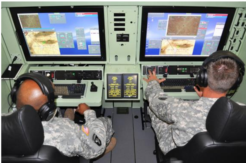
Figure 2. Universal Mission Simulator (UMS). (U.S. Army, 2015).

One UGCS emulator (Long, 2017) and one UGCS Universal Mission Simulator (UMS) (Ficken, 2017) were used during the validation procedure. The emulator and UMS are the same device except, the UGCS emulator reflected the same hardware and software to operate a MQ-1C Gray Eagle UAS; the UGCS UMS reflected the same hardware and software to operate the RQ-7BV2 Shadow 200 UAS (Long, 2017). The UMS replicated radio communications equipment with photographs of the equipment in their respective locations within the UGCS. System-specific Operator's Manuals and Checklists were provided and used during the data collection for each test flight card. Two fully-software-functional UGCS running simulated telemetry data provided fidelity to accurately replicate each proposed operational procedure. The use of simulation to validate operational procedures significantly mitigated the risk of loss of aircraft, equipment, or personnel while performing the flight test cards for abnormal and emergency operational procedures. No other special equipment was used or required.