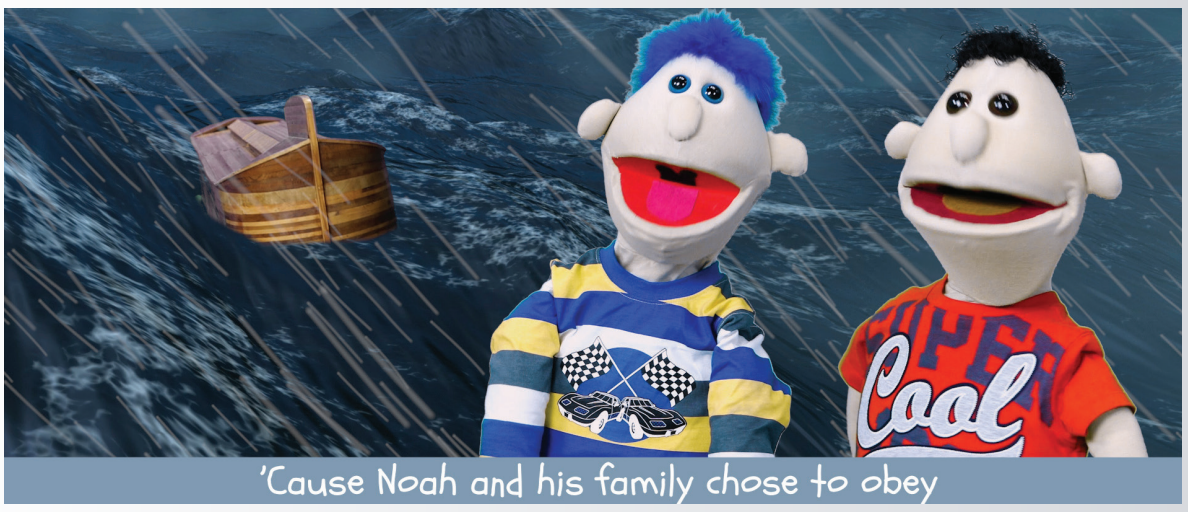
Figure 4. A scene from Series 1, Episode 8 about Noah's ark.