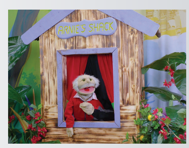
Figure 3 . Arnie, one of the puppet characters, wrapping up the program with a reminder to viewers that they are children of the King

For more information go to the Abide Family Ministries website at abide.com.au and look for the King's Kids tab or access programs on the Arnie's Shack YouTube channel.