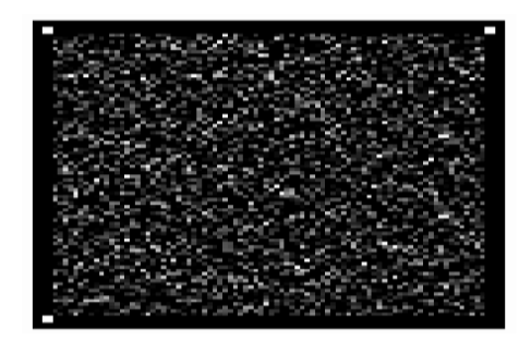
Figure 4. Tx code for OCC system