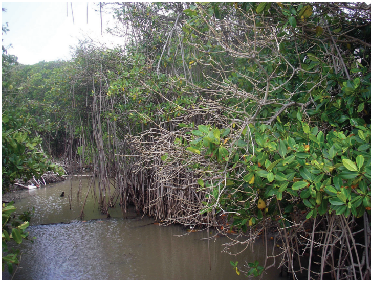
Vulnerable and important mangrove forests in Saint Lucia.

In the area of Risk and Vulnerability Assessment and Monitoring , the biggest challenge will be applying a common tool for monitoring across the Region. This is because of the diversity in numbers and types of plans and risk management programmes across CARICOM Member states. Additionally, consultants found that many of the national plans were out of date in their consideration of risk ratings and structural vulnerability assessments were limited, and often irrelevant.