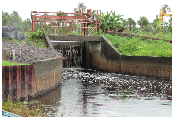
Managing water levels in Guyana.

In the area of Assessing Agriculture Sector and Sector Dependent Infrastructure Capacity to Cope , consultants found that there are inadequate protective infrastructures, such as dams, levees and flood barriers, as well as inadequate maintenance of existing infrastructures. The food chain supply and administrative infrastructures are also vulnerable, but to varying degrees around the Region.