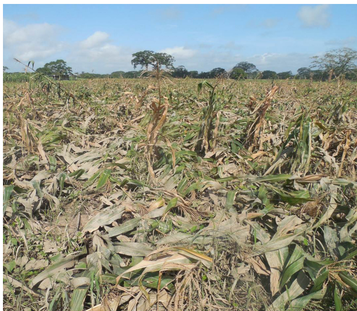
Destructive Impacts of Hurricane Earl (August 2016) on an-APP Climate Smart Evaluation Trial for Water Stress in Corn (Maize), Belize

It is easy to understand the impact of both climate change and natural disasters on their own, but perhaps more difficult to understand why the APP has grouped them together in their initiative to create a resilient agriculture system.