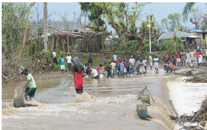
Dealing with the after effects of Hurricane Matthew in Haiti, 2016.