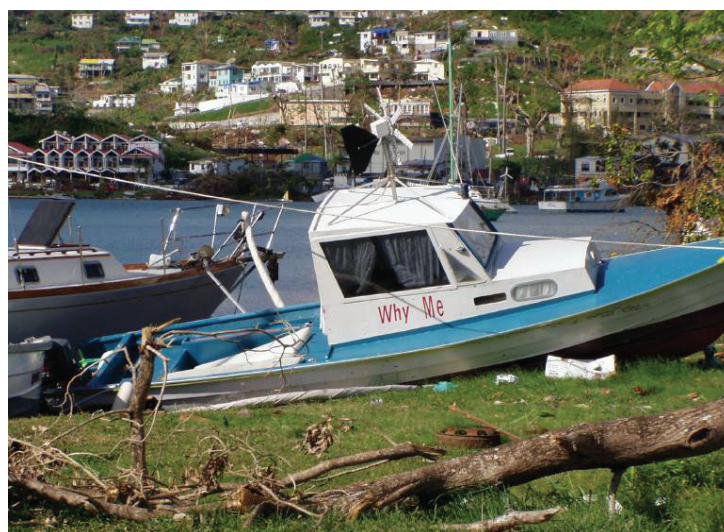
Damages to the fishing industry in the Caribbean after Hurricane Ivan in Grenada, 2014

A resilient people deserve a resilient food system and the APP and its implementing partners are keen to see that happen.