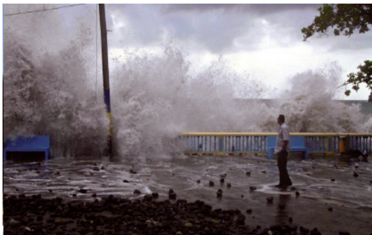
Hurricane Omar hits the Caribbean in 2008.

First, the national CDM plan was usually a fair predictor of the integration of DRM into national agricultural plans. Second, hazard experiences, no matter how significant, didn't seem to increase a country's commitment to capacity building or investment to fill identified gaps in relation to response, relief and recovery. As expected, the scores of the countries with a higher level of per capita income reflect a greater readiness to respond to disasters and climate change. Unfortunately though, it is those countries that have the lowest agricultural contribution to GDP. Conversely, those countries with the lowest income per capita and the highest agricultural contribution to GDP, have the lowest scores.