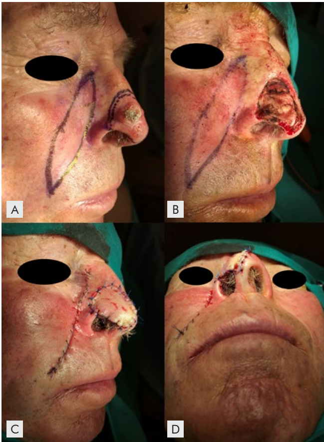
Figure 5 - Tunneled interpolated melolabial flap for a defect of the tip, right sidewall, ala and soft tissue facet. (A) delimited tumor and flap design; (B) tumor excision; (C) flap sutured in place; (D) flap sutured in place (inferior view).

supply and cannot safely be thinned of as much of its subcutaneous fat. 3 The flap is then sutured into the wound without tension, slightly sinking the flap below the surrounding edges. 12 The donor defect is closed up primarily to the base of the pedicle.