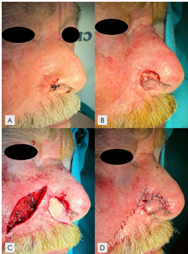
Figure 3 - Tunneled interpolated melolabial flap for a defect of the right nasal ala. (A) primary tumor; (B) tumor excision; (C) flap movement; (D) flap suture.

techniques to help minimizing this problem. 11,12 Intralesional steroid injection can also help to correct this deformity.