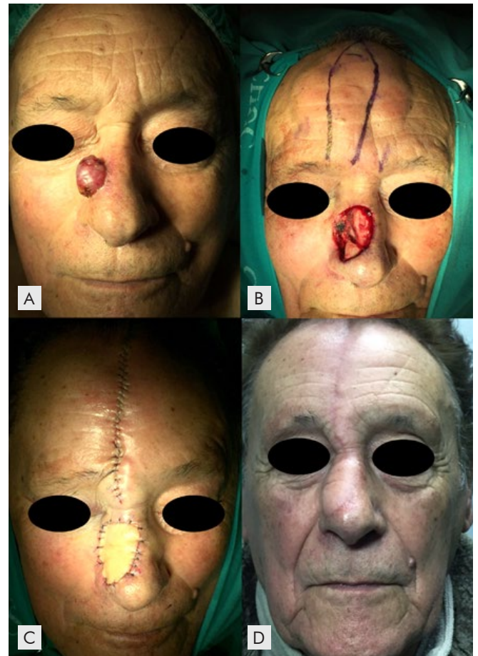
Figure 2 - Tunneled interpolated paramedian forehead flap for a defect affecting the right nasal sidewall and dorsum. (A) primary tumor; (B) tumor excision and flap planning; (C) flap sutured in place; (D) three-months post-operative with significant trapdoor effect.

Fourth, tunneled flaps are also prone to trapdoor effect, 11 particularly when they are relatively bulky with round borders 12 (Fig. 2D). However, a subtle trapdoor effect does not always require a revision, as massaging the scar might be enough to flatten the region. Reducing the flap size in 20% to 25% as compared with the primary defect, suturing in a way as to lower the flap below the surrounding skin and undermining extensively the borders of the receptor area are