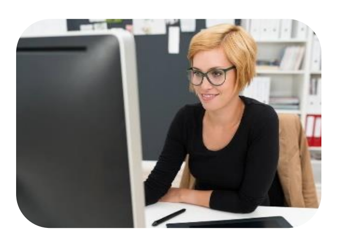
Goal 2: People

To implement state of the art research systems to support the development and showcasing of high quality institutional research