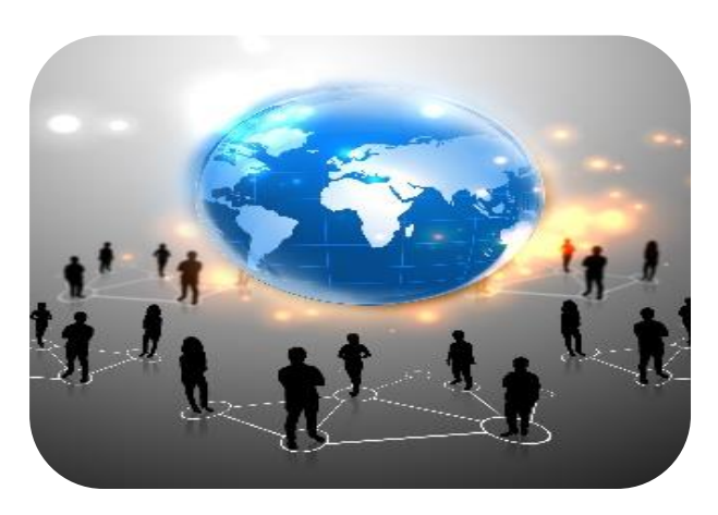
Goal 3: Collaboration

To expand institutional research output through the strategic development and recruitment of high quality staff