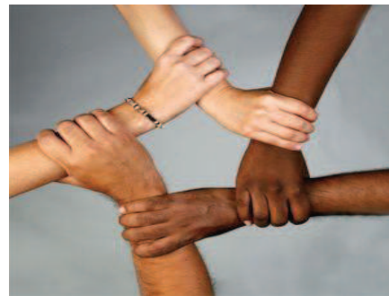
Fig. 1: Samples for human skin

1. Read the image header, BMP head 2. For i = 1 to BMP head height 3. For j = 1 to BMP head width 4. Read pixel Color 5. Mx = \text{Max} (\text{Color} \times R, \text{Color} \times G, \text{Color} \times B) 6. Mn = \text{Min} (\text{Color} \times R, \text{Color} \times G, \text{Color} \times B) 7. \Delta = Mx - Mn 8. If ( Mx = \text{Color} \times R ) then 9. H = (\text{Color} \times G - \text{Color} \times B) / \Delta 10. Else If ( Mx = \text{Color} \times G ) then 11. H = 2 + (\text{Color} \times B - \text{Color} \times R) / \Delta 12. Else 13. H = 4 + (\text{Color} \times R - \text{Color} \times G) / \Delta 14. End if 15. H = H \times 60 16. If ( H < 0 ) then 17. H = H + 360 18. End if 19. If ( T_1 \leq H \leq T_2 ) then 20. Detect pixel as skin 21. End if 22. End 23. End