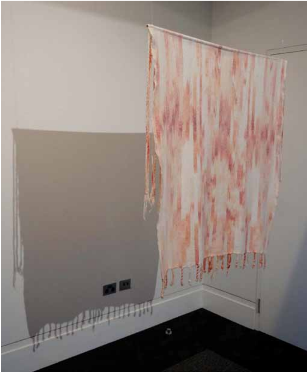
Figure 6. Heirloom - installation view, front view showing "heat map".