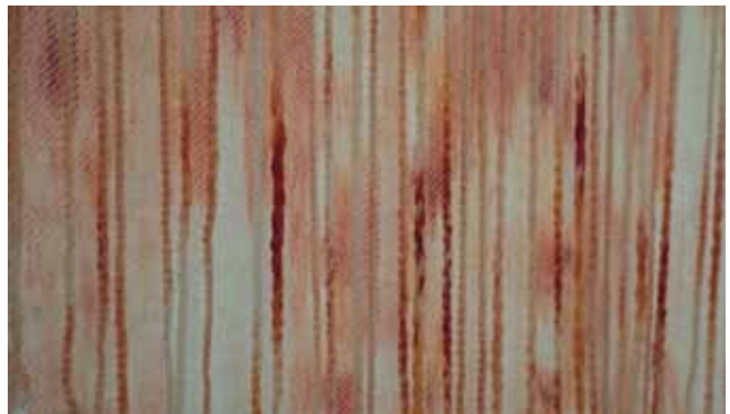
Figure 5. Heirloom , installation view, rear view showing tassels.