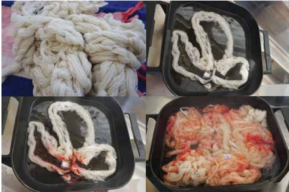
Figure 3. Composite image of dyeing process. Our cohesin loop-model experiment used red dye to mark the areas of contact where the cohesin molecule complex would be. When laid flat, the relationship on the lineal warp to the compacted or folded state of the chromosome was revealed.

of red marks spaced along the straightened warps now revealed the interactions which had been occurring between the sequences amongst the neighbouring loops, as previously packaged in the dye bath (our noodle wool soup/cell nucleus). The final woven piece mimicked both the appearance of a “heat map” and the ikat form of weaving.