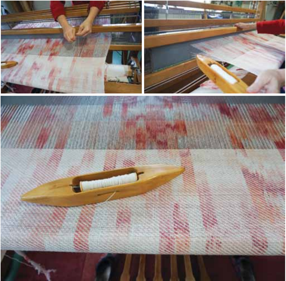
Figure 4. Composite image of Christine Keller weaving , work in progress.