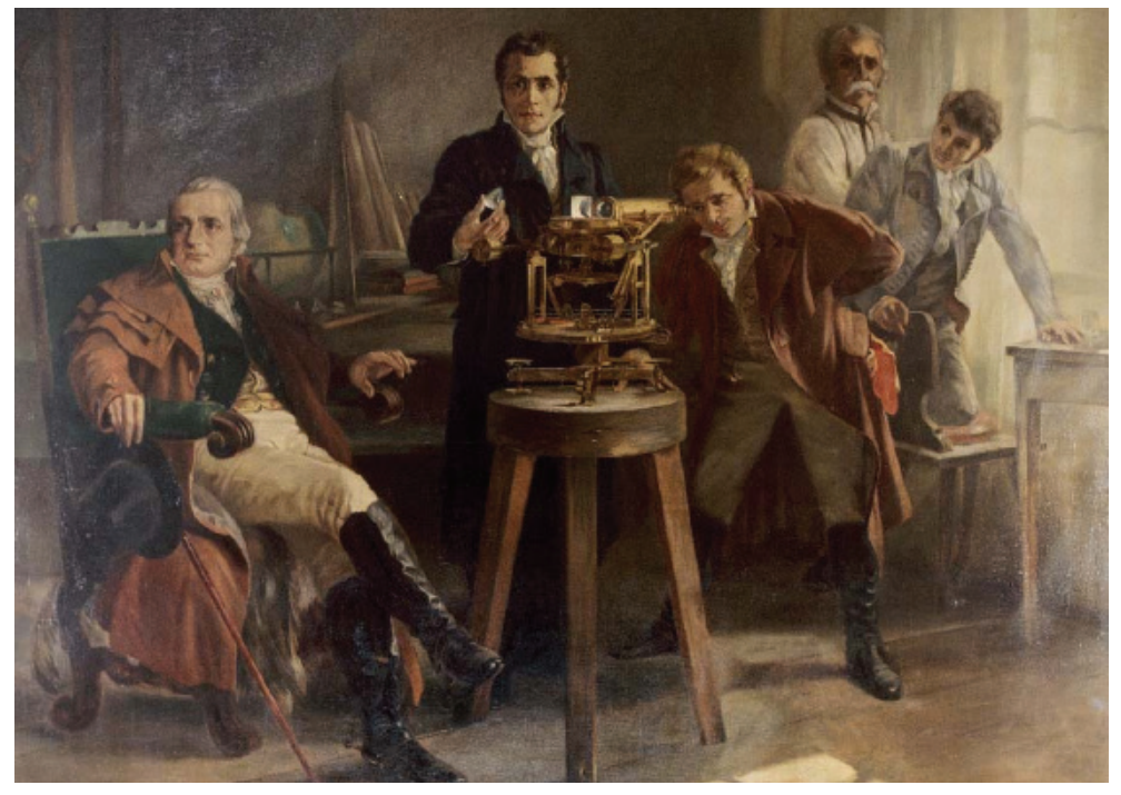
Figure 6. Richard Wimmer, Joseph von Fraunhofer Demonstrating The Spectroscope, c.1900.<sup>15</sup>

How do we know that it is hydrogen gas in the nebulae clouds and what does that mean exactly? In 1814 Joseph von Fraunhofer discovered that, when viewed through a spectrograph, the spectrum of a hot gas was broken by dark lines. Each gas was found to have a unique pattern of these spectral lines. Systemic studies in the nineteenth century of stars and nebulae and other celestial objects, such as comets, revealed that the spectra of stars are very different from the spectra of nebulae. Modern spectral examination of gaseous nebulae, in both the emitted and absorption spectrums, confirm that the major constituent of the universe is hydrogen in one form or another.<sup>14</sup>