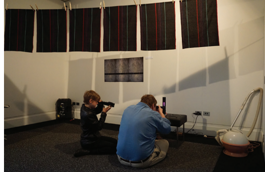
Figure 7. Spectrogram of the Hydrogen gas lamp as photographed during the floor talk.