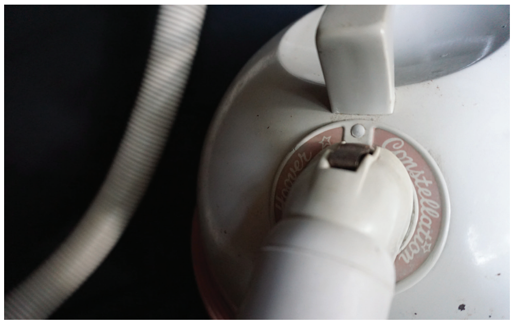
Figure 2. Hoover Constellation vacuum cleaner - close up view.

In 1957 the launch of the satellite Sputnik spawned a wave of space-inspired home design. A kind of cold war developed in domestic appliance design for example, Russia gave us the "Saturnas" vacuum cleaner and Hoover brought us the ConstellationTM (pictured above), boasting it floated on air/in space. The Constellation™ pictured is still in use by local Home Scientist Pam McKinlay.<sup>1</sup>