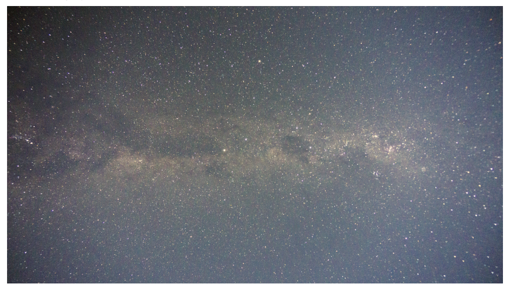
Figure 5. Pam McKinlay, photo taken at Mt John observatory, July 21 2016. The Coal Sack nebula is prominently silhouetted against the southern Milky Way along the edge of the Southern Cross. Many nebulae are visible to the naked eye and have old histories in ancient star lore. Orion's nebulae which is one of the most studied opaque area in the Milky Way has been described as: "... angel's breath against a frosted sky.<sup>8</sup>"

So it was with great excitement that we first encountered the new Dunedin Planetarium where we could view the Dunedin "Sky tonight" in high resolution and luxurious comfort.<sup>5</sup> In "Te Marama Whetu" old stories of Māori and Pacific whakapapa shimmered and blinked as cosmic skyscapes of living wisdom. The stars were put back into the stories so that we could see the heavens through the lens of ancient knowledge. Spoilt for choice, our dilemma was what to choose for the Art and Space project. Old friends of the Zodiac,<sup>6</sup> unfamiliar constellations of familiar stars reconfigured from stories of Pacific navigation, the planetary dance from our local galaxy, perhaps Saturn in gorgeous three quarter view with Cassini slicing through its rings, or maybe spectacular features of the southern sky such as the Jewel Box? We took our cue from the "Amazing Universe" written by lan Griffin, astronomer and Otago Museum Director. Our attention was drawn to the fuzzy patches of the celestial-scape. When magnified these gaseous clouds of the nebulae revealed not only the most glorious picturesque formations but in them we discovered the loci of star nurseries and our Interstellar project was born.<sup>7</sup>