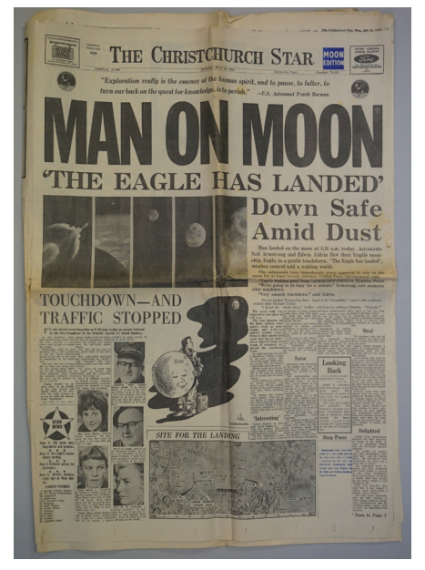
Figure 4. The sacred clipping from the suitcase under Pam McKinlay's bed. Front page, The Christchurch Star, "Moon Edition," Monday 21 July, 1969.