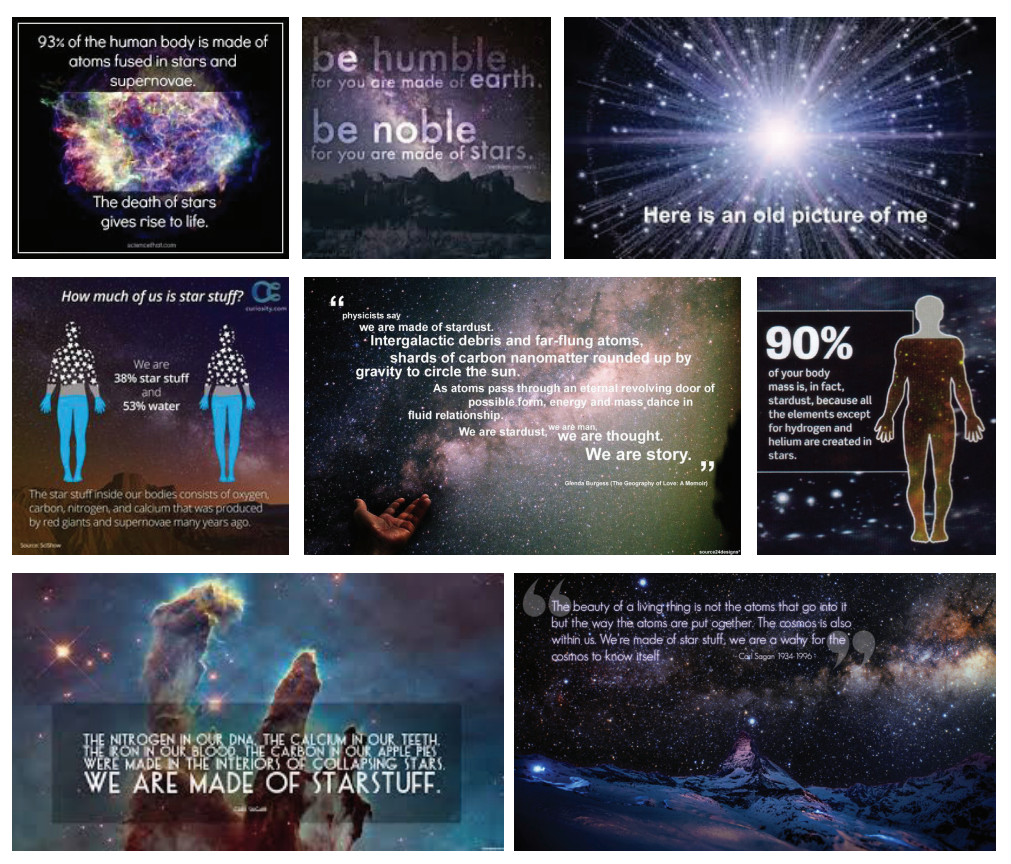
Figure 11. Random sample of "we are made of space dust" memes from "we are made of star dust" google image search

Cosmic memes,<sup>20</sup> compete with cat gifs,<sup>21</sup> on Facebook to tell us this, so it must be true! I whizz around the house vacuuming and consider the nature of the terrestrial dust. Intellectually I know it must once have been cosmic baryonic matter also. Without stars there would be no us—no life. Life on our planet is sustained by our star — the Sun, Sol, Sonne, call it what you will — it supplies us with heat to keep our water liquid and provides light energy for photosynthesis (our food and oxygen). Once upon a time all the earthly elements were also forged somewhere out there in space, and we are a part of it. Space is a living entity. Thousands of years ago our relationship with the macrocosm and microcosm was an intimate personal experience and the stars were our guide. Today we search for a daily reminder, which acknowledges the abstract enormity of space and the humbleness of our personal existence. Our new talisman should tell a story — present the data, but