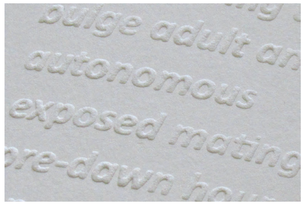
Figure 6. Book detail from Glistens with Nectar showing the raised surface of the embossed text.