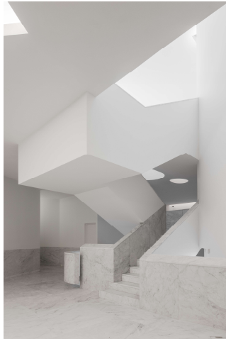
Fig. 1: Stairs of the International Museum of Contemporary Sculpture, in Santo Tirso, Portugal. Siza Vieira, 2010-2016.