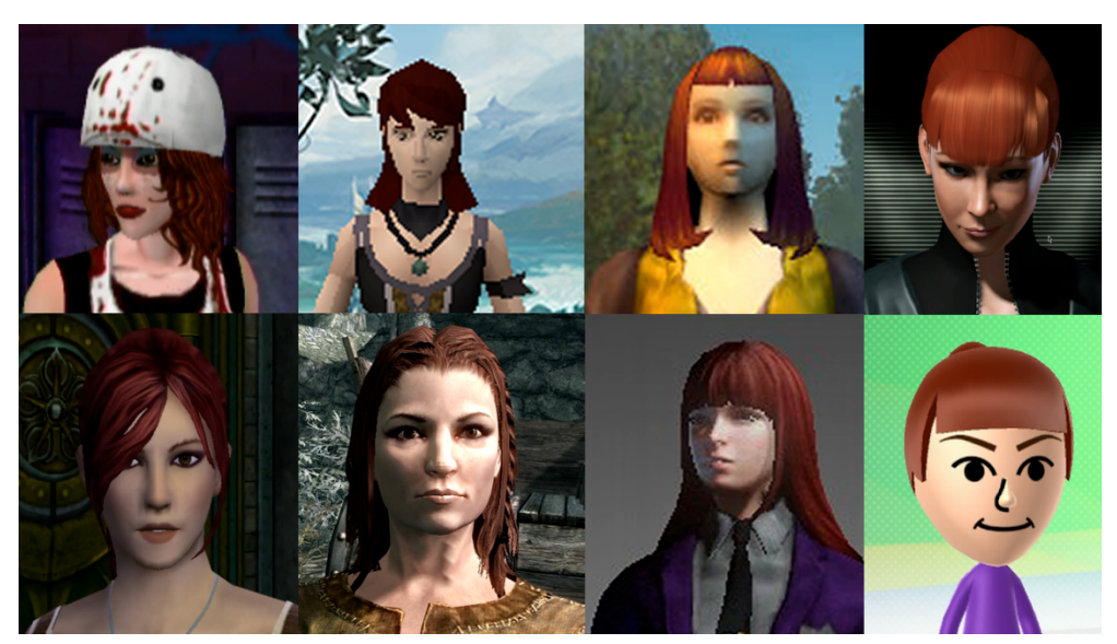
Figure 1: Eight avatars created in the micro-autoethnographic task.

Once I had completed preliminary notes and analyses on my past experiences playing and customizing avatars in each of the game spaces, I then proceeded to create a trans-ludic, representative avatar in each game: World of Warcraft, EVE Online, Saints Row IV, Jam City Rollergirls, Skyrim, RuneScape 3, Rift, and the Mii Creator. Resultant avatars are shown in Figure 1. Subsequent video footage was then transcribed and analyzed for UI selection and manipulation events. In addition, a reflective narrative on the experience was also recorded by hand and included in the analysis.