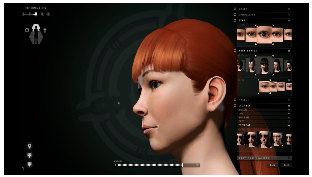
Figure 3: Creating my avatar in EVE Online.

Each interface was chosen due to my own familiarity and past experiences with these games. In all cases, I had spent a year or more playing with avatars in each of these ludic spaces. Notably, the interfaces vary with regard to complexity. For example, the Mii Creator and RuneScape 3 interfaces are both relatively low-fidelity affordances. In contrast, Saints Row IV, Skyrim , and EVE Online offer relatively high fidelity CCIs and produce more realistic looking avatars.