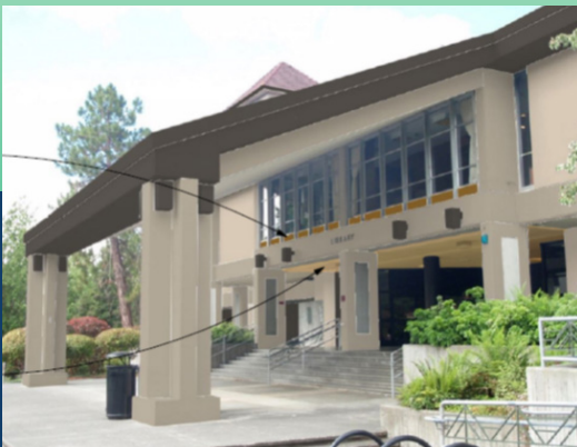
Library exterior west, Seismic Retrofit rendering