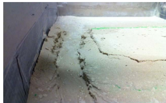
Fig. 4. Failure in centrifuge test; water flow = 0.56 lit/min, g = 20