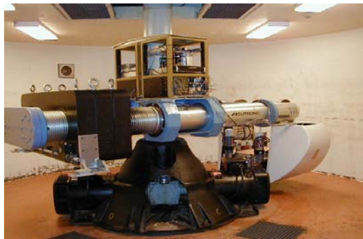
Fig. 1. RPI 150 g-ton geotechnical centrifuge

Small-scale erosion on earthen embankments is being studied, modeled and simulated, with respect to the formation of rills and gullies. Validation of the simulations was one of the primary goals of this research. Therefore scaled-down model levees are used to perform erosion experiments at 1-g and at higher levels of g in a geotechnical centrifuge. The results of experiments to date are presented in the following sections. Different water flows were used and complex geometries and boundary conditions utilized to quantitatively assess the effects of differing conditions. The physical models serve as the basis for developing accurate, digital simulations of the embankment erosion processes. The erosion processes described in this paper refer to hydraulic erosion. The time elapsed from initiation of initial rill erosion began at the crest of the landside slope to the time the eroded channel reached the crest on the waterside slope ( t_{breach} ) was measured during the tests. Photographs and videos were taken before, during and after each test. In order to simulate large scale prototype levees centrifuge tests were performed at 20g's (Fig. 1).