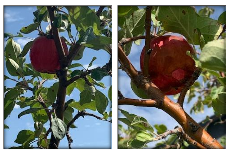
A "Perfect" Apple.