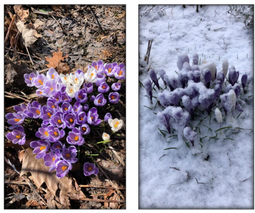
Croci Blooming in Spring Debris. Croci Flourishing in Spring.