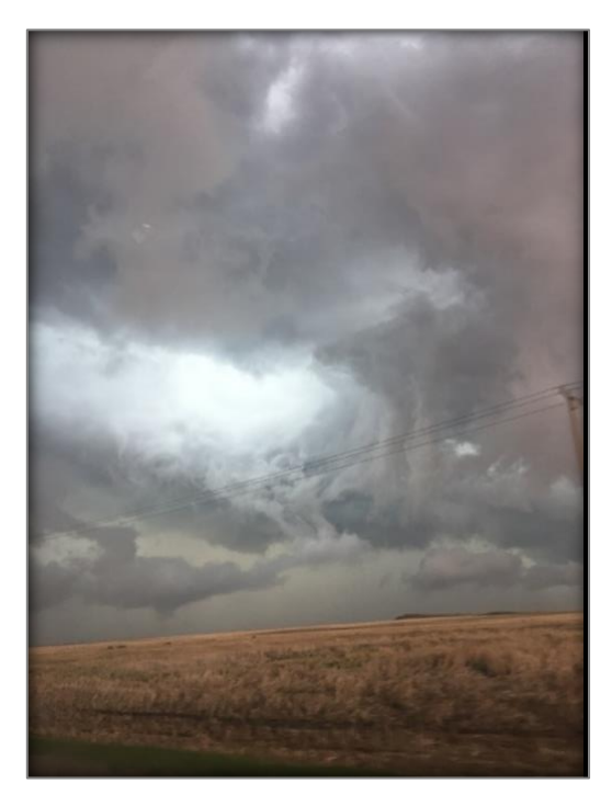
A Prairie Storm.

Some days my body feels broken from the inside out Like a swallow or hummingbird in a Lorna Crozier poem Wounded or damaged, wings clipped