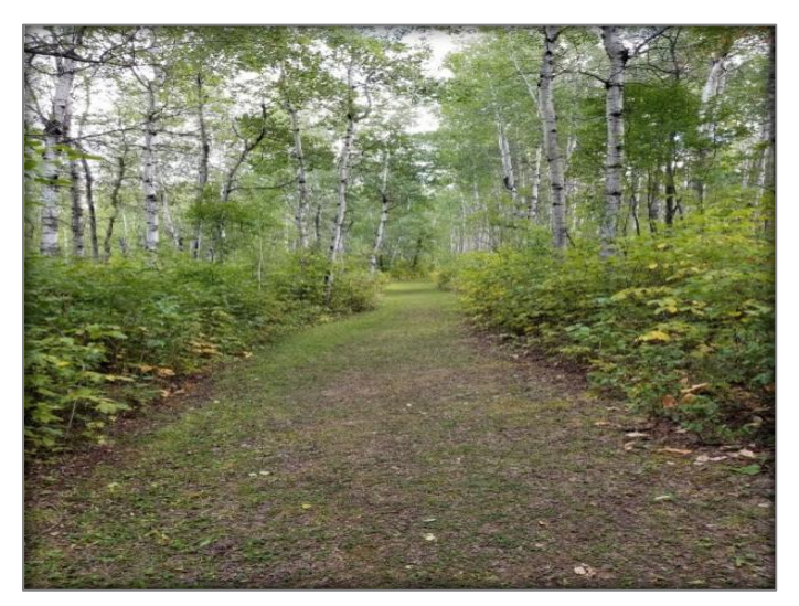
A Parkland Path.