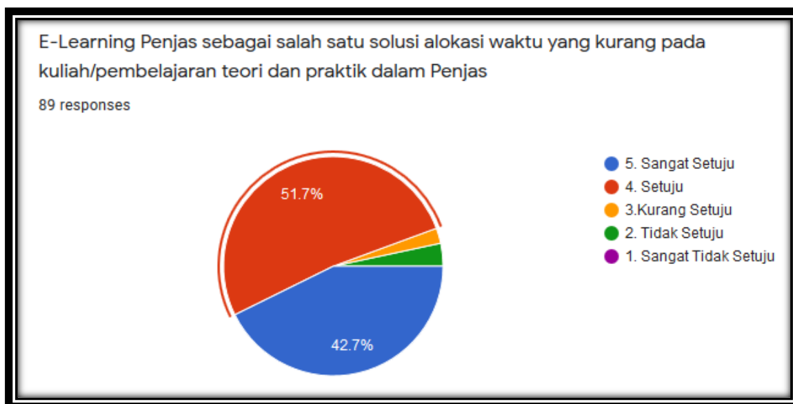
Figure 1. The Result of E-Learning Physical EducatioHasil Survey

E-learning becomes a popular tool as an interactive tool for virtual education (Darmayanti et al., 2007). The implementation of e-learning is supported by learning systems, learning assessments, and operational service support systems (Sefriani & Sepriana, 2020). Physical Education e-learning at IAIN Salatiga is one of the solutions to solving the problem of time constraints in lectures and facilitating the theoretical learning of Physical Education. The following survey results are used as a basis: