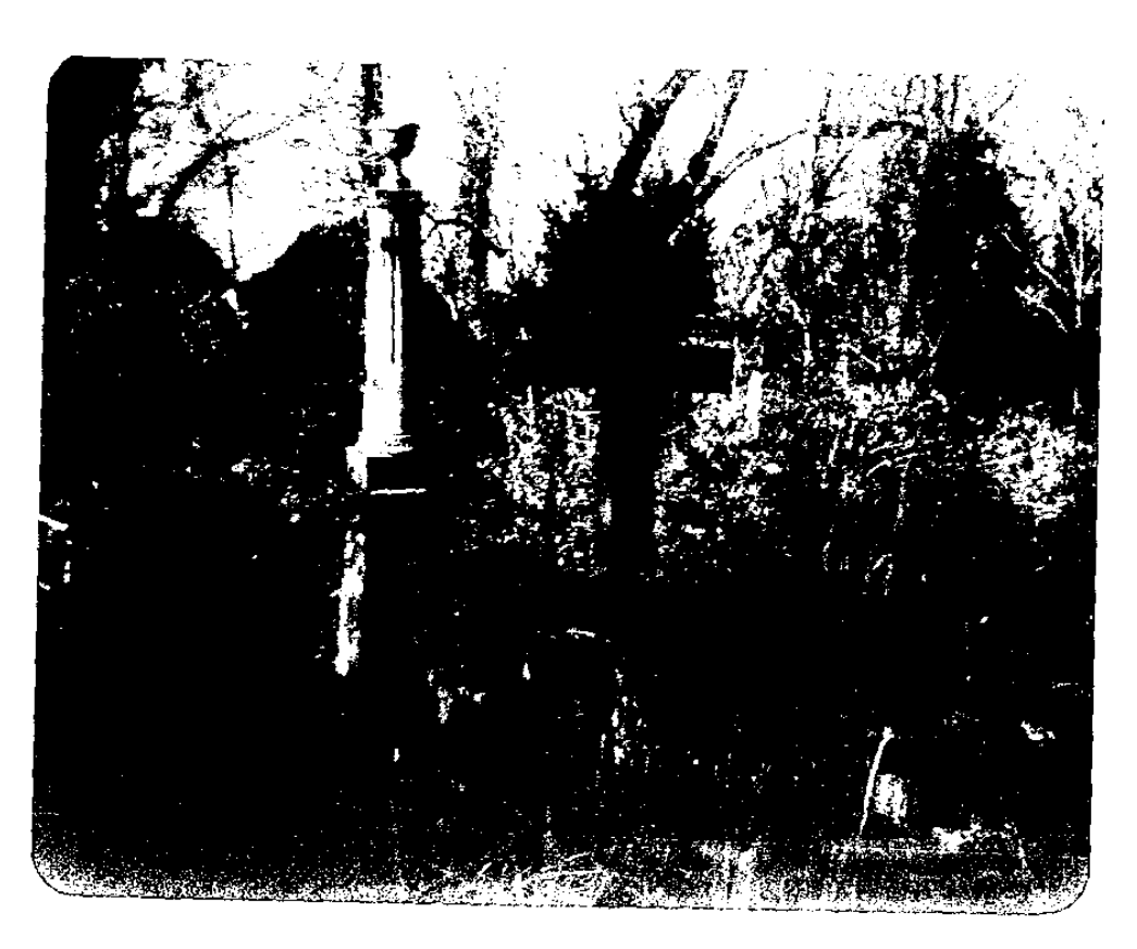
Lot 1067 in Laurel Grove.