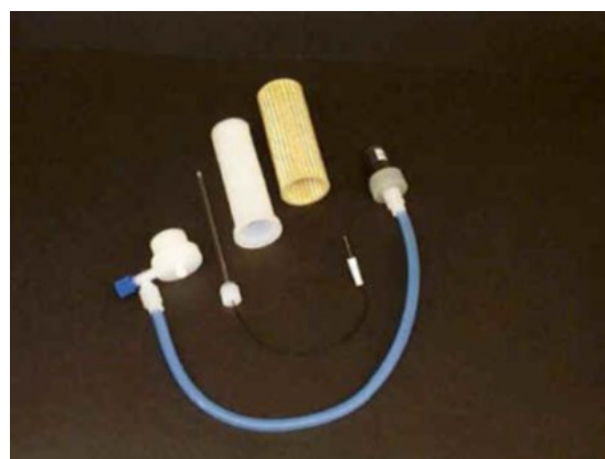
Figure 2. Pressure sensor, temperature sensor, vessel and sleeve (left to right) [20]