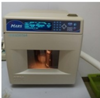
Figure 1. Microwave accelerated reaction system machine [20]

(the blue tubing in Figure 2), and (2) connector and electronic control. A pressure sensing load-cell placed in a black cylinder. Actual pressure in vessels is detected by the load cell, and the load cell delivers a signal to the electronic control unit.