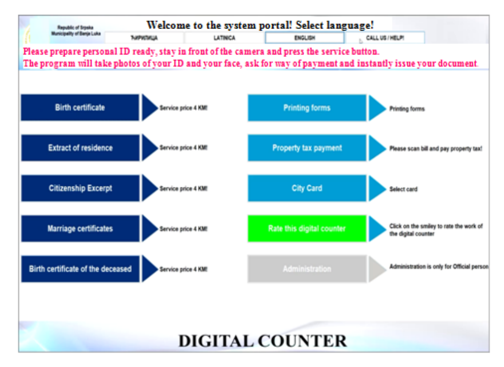
Fig. 2 Main menu of Web based software solution for smart city services

security, which will guarantee users discretion on their personal data and availability of the service. Appropriate cryptographic methods can be used and were used for protection of user data and information.