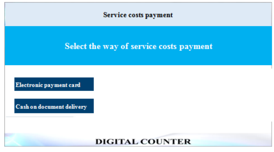
Fig. 3 Menu window for selection of way of service costs payment

As an example of using the system, Figure 3 shows the menu window or submenu for selection of way of service costs payment when the service is to be paid. The user selects one of two possible ways by what he/she wants to pay the service costs. Costs for all services and documents can be paid by the user electronic payment card. Only such types of documents that are delivered to the user by regular mail service, express mail service or by the city delivery service can be paid by cash on delivery time to the user on user defined address.