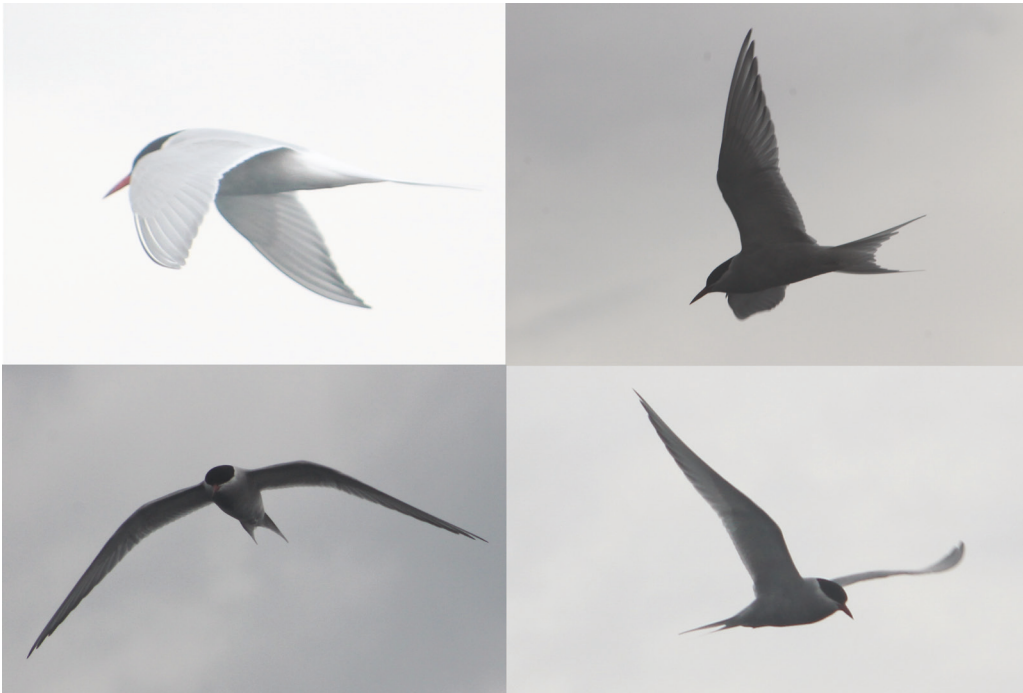
Figure 2. Antarctic Tern Sterna vittata , at sea off Rio Grande do Sul, Brazil ( c.34^{\circ}07.3'S 51^{\circ}18.7'W ), 3 September 2012