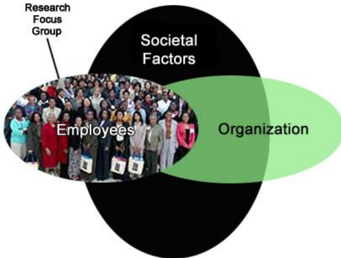
Figure 3.1: The Employees and Organizational Perspectives