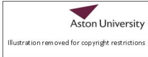
Figure 5: Worldwide Number of Organisations with ISO 14001