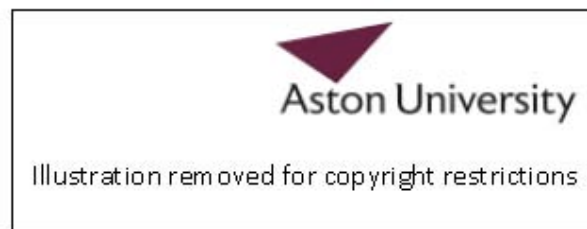
Figure 3: Model of Corporate Environmentalism Based on Research Findings

competitive advantage) and ethical motives which are driven by leadership and corporate values. Bansal & Roth's model goes some way to highlight the possible factors in businesses being more responsible in terms of the environment, however, Bansal and Roth themselves criticise this model as being too simplistic in that it does not fully explain the contexts within which the four factors exist. Bansal and Roth studied a number of businesses and undertook interviews with the environmental managers and found that the model they constructed from the previous research was too simple and produced the following model: