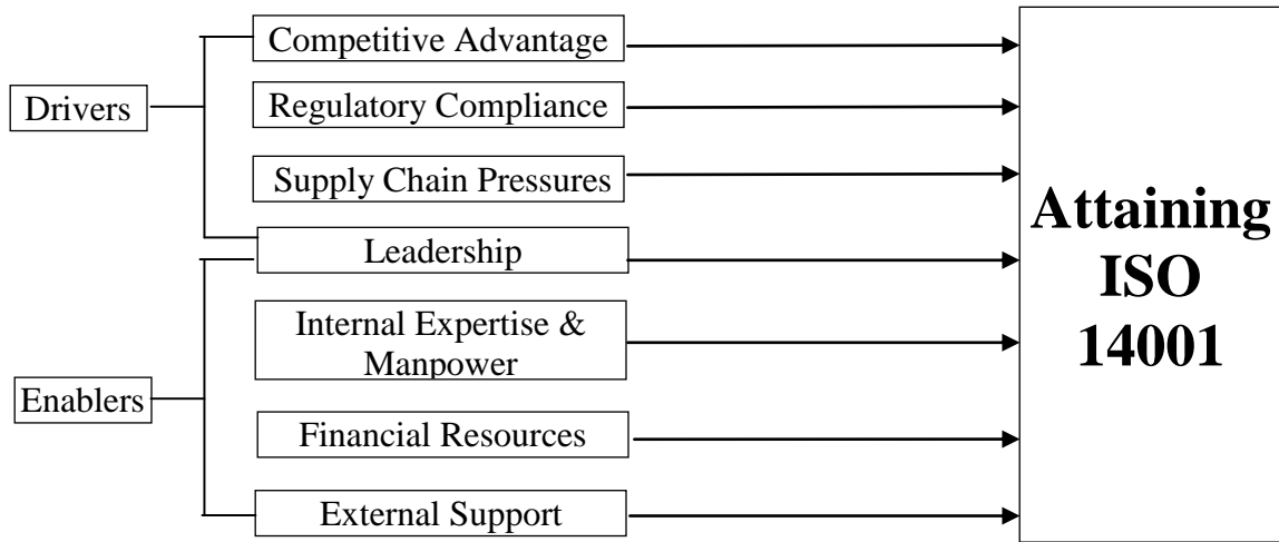
Figure 8: Influencing Factors for SMEs to Attain ISO 14001 Based on Existing Literature

The above model shows two groups of factors that based on the literature review may in some way influence a SME going through the process of attaining ISO 14001. The first group of factors are “drivers” which may motivate an SME to attain ISO 14001, these are: competitive advantage; regulatory compliance, supply chain pressures and leadership. Apart from supply chain pressures there are no clear strong motivations in the literature why SMEs would do this (the majority of research looks at the barriers), therefore the other three factors have been chosen as the most commonly attributed factors for all businesses (regardless of size). This research will identify whether these factors are relevant for SMEs. With many of the past pieces of research being fairly dated (research in the area of environmental management amongst SMEs is still far less common compared to research into larger firms) it will be interesting to see whether any of the motivations in the model that predominantly apply to larger businesses may now also be present in smaller businesses, especially with environmental issues being higher up the public, political and regulatory agendas.