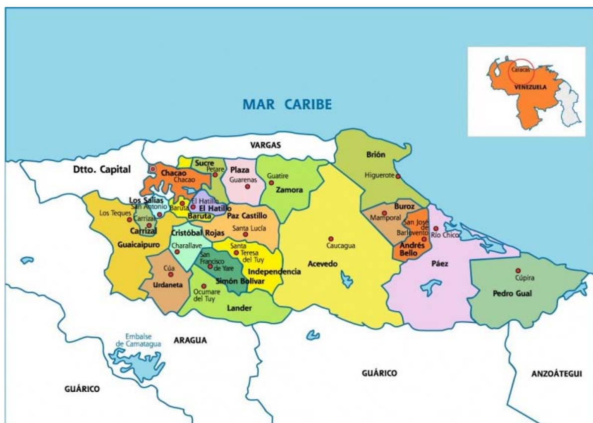
Map 1. Miranda State and Greater Caracas

The following pages present maps demonstrating the locations where the interviews were conducted.