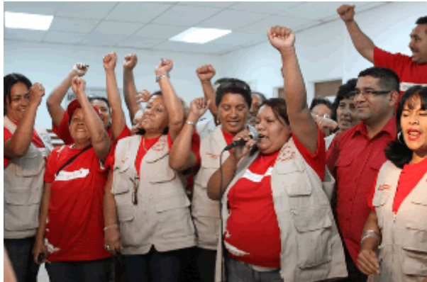
Photograph 10.1 El Banco de la Comuna Socialista

The photograph that accompanies the story is as follows: