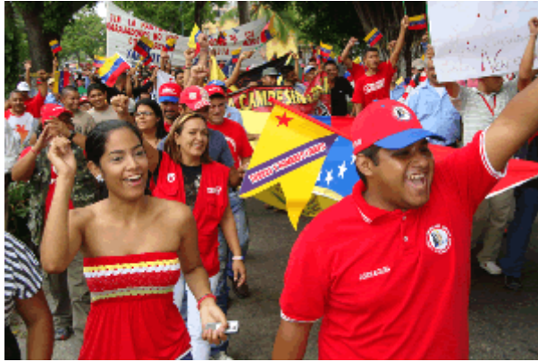
Photograph 10.2 Community Councils march in support of the political and economic project of the National Government

These examples ratify the argument that has been widely shown in previous chapters about the constant changes introduced by the government to increase participation without explaining exactly what it is that people are supposed to be participating in and how. These changes are learned by citizens on the basis of their enforcement in the communities. The second example shows how CCs are used for political practices, which reinforces the idea discussed about the influence of politics on the direction and functioning of the CCs.