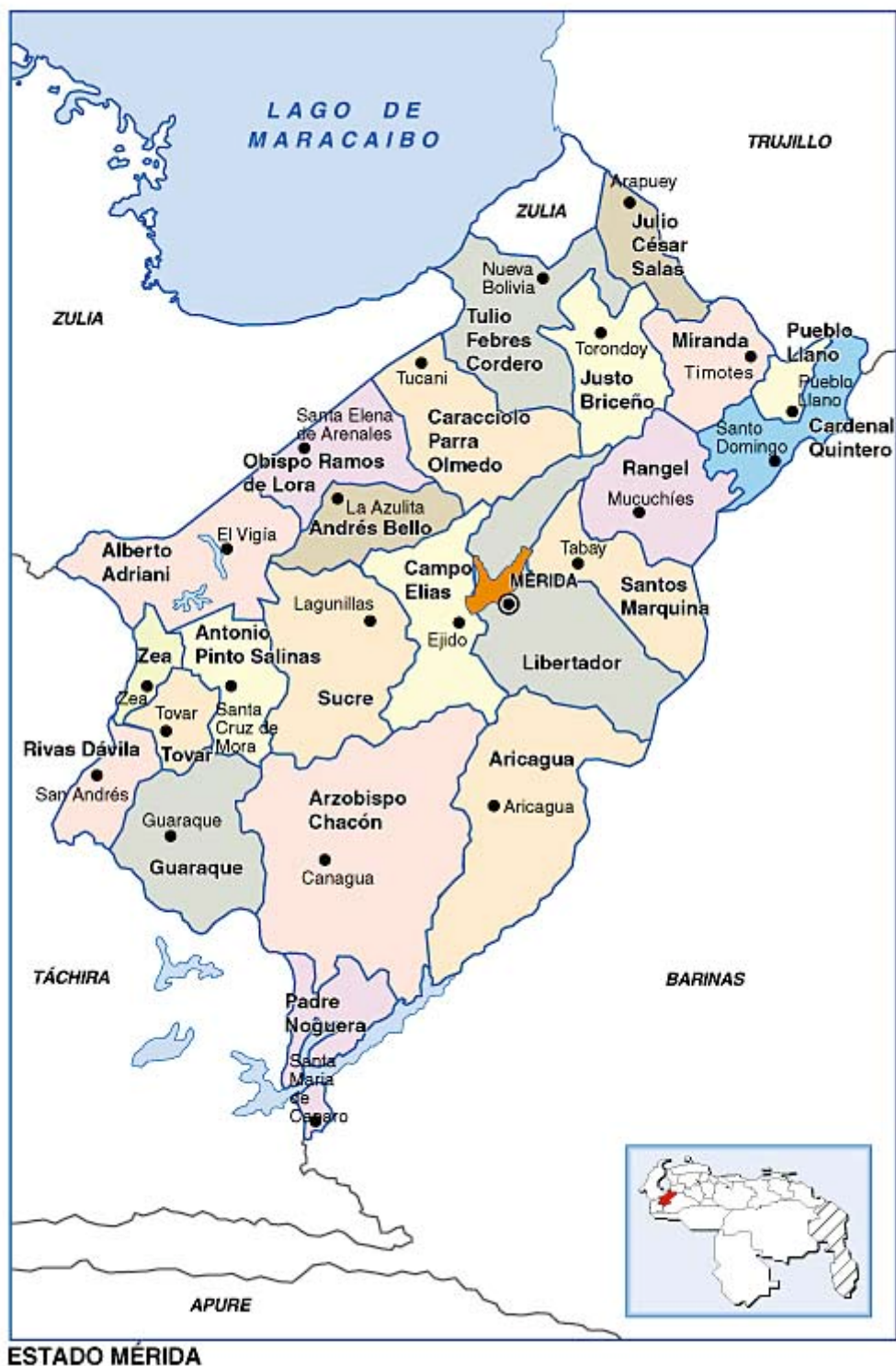
Map 4. Mérida State