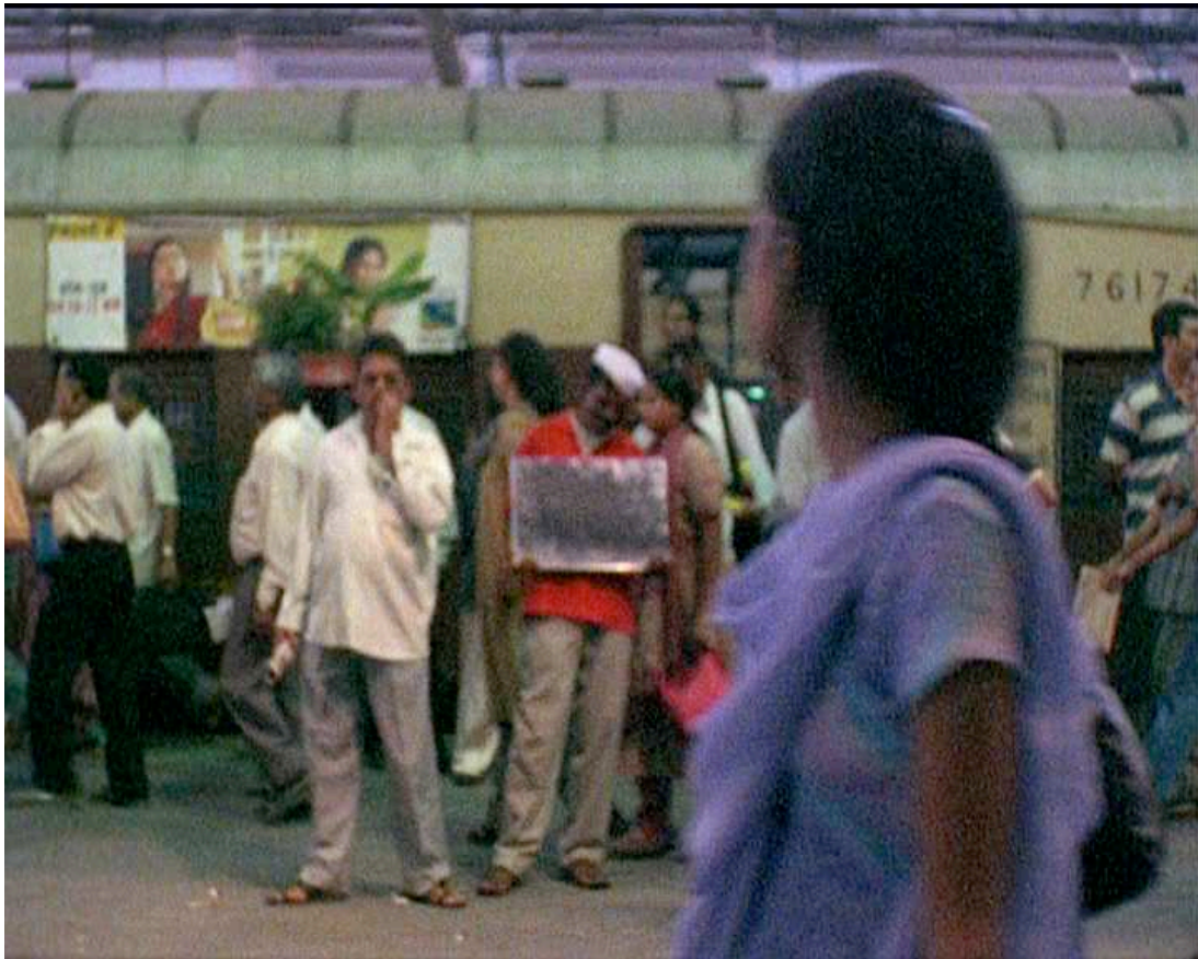
Screen grab from camera roll: The Autonomous Object?

ultimately presents an ethical dilemma as to the objectification and appropriation of people as image objects. In this way The Autonomous Object? title begins to form itself into a question as to the filmmaker's, viewer's and participant's autonomy within the endless repositioning, re-looking and re-mirroring of images described in the quotation of Augé in Chapter 2, where our contemporary experience of images is a complex multilayered process of repetition and feedback where from time to time all references to any reality whatsoever disappear. This is a reiteration of Augé's theory: "a vision of humanity caught in a proffered game of mirrors deprived of the category of the real ... To put it in a nutshell, we all have the feeling that we are being colonised but we don't exactly know who by" (Augé, 1999 p6).