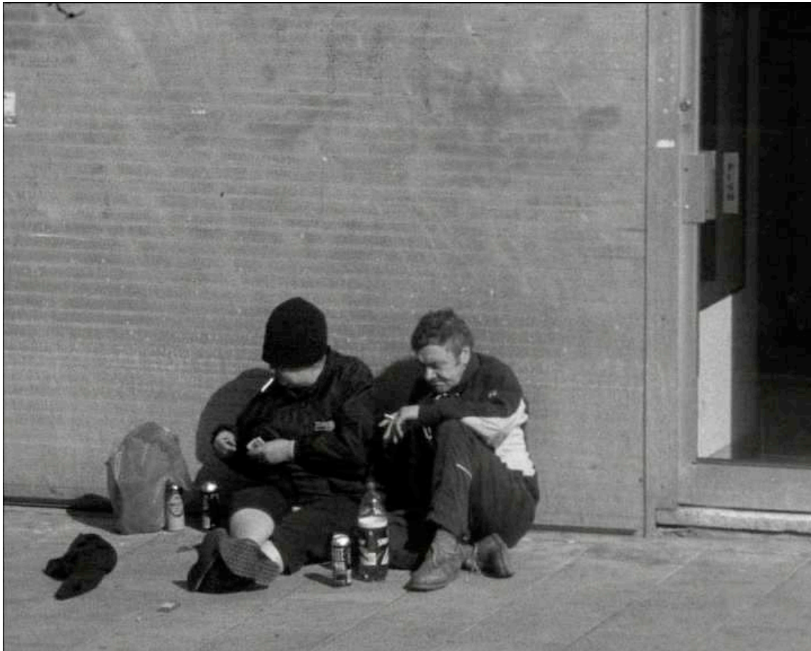
Captured still from The Exception and the Rule View from my kitchen window in Brixton

LOCATIONS Karachi, Mumbai, London DIMENSIONS A continuous work being various combinations of description and observation. MATERIAL Anthropology, Structural Film START The view from my kitchen window in Brixton.