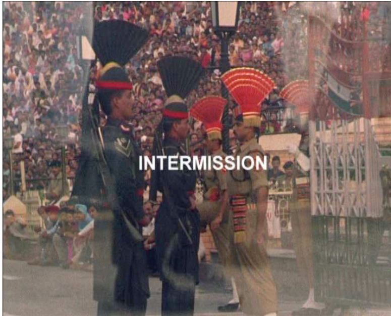
Captured still from The Exception and the Rule

This INTERMISSION is an experiment in communicating thinking processes that led to The Exception and the Rule as they developed over time. These ideas are presented here as “field notes”, though to be accurate this writing was not constructed on location in the field (India, Pakistan). Instead these notes present my grappling with theories and ideas before travelling on my first trip to India (hereinafter: FIELD NOTES A) interwoven with a critique of these ideas before travelling to Pakistan (hereinafter: FIELD NOTES B). My actual field diaries are not quoted here because it is the contention of this experiment that the INTERMISSION is the gap between field trips and not the experience of being abroad. Positioning these thoughts originating in London (which are edited, mediated and interspersed with scholarly apparatus) as field notes prompts the question: where is the field located?