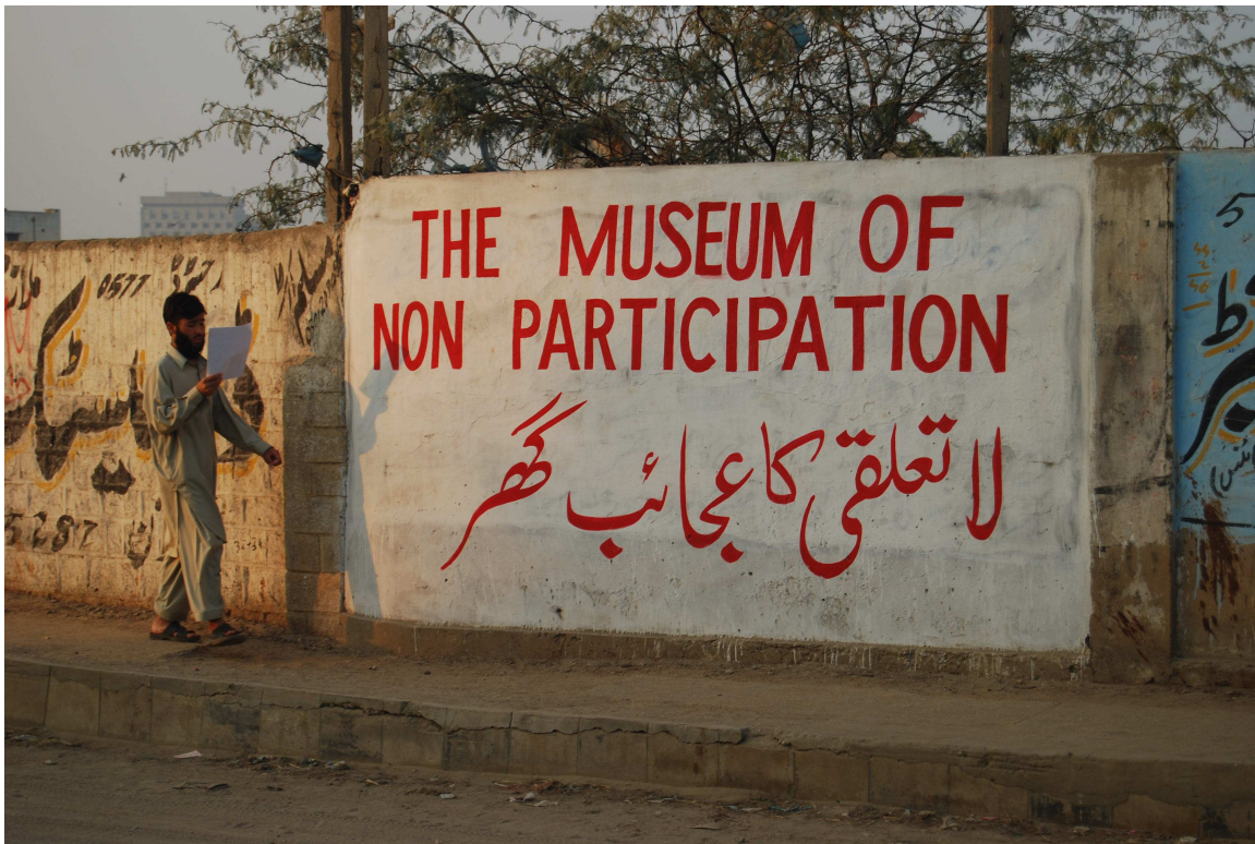
Wall chalking Karachi 2008

As The Museum of non Participation is only now starting to emerge as a full body of work (it launched in Karachi in September 2008 and London in October 2009), this conclusion cannot tie up its ideas in final form. Instead what is proposed here is the evolution of The Museum of non Participation in order to determine where this new platform coincides with this thesis and The Exception and the Rule , whose last scenes were filmed as the museum was being launched in Pakistan. In this way it is an unresolved emerging argument running through this conclusion that the question How can structural film expand the language of experimental ethnography? implicates more than just film. In the face of the complex realities of late modernity Marcus's statement that textual categories are more easily achieved in a cinematic medium could also be reversed to consider the question as to where the cinematic medium begins and ends. Similarly given the complex layers of (non) participation involved in this work it is also an unresolved question as to where collaboration and authorship over this project begins and ends including my long term collaboration with Karen Mirza. Thus The Museum of non Participation presents itself as a potential subject for a post-doctoral work that extends my initial research question by expanding into new areas.