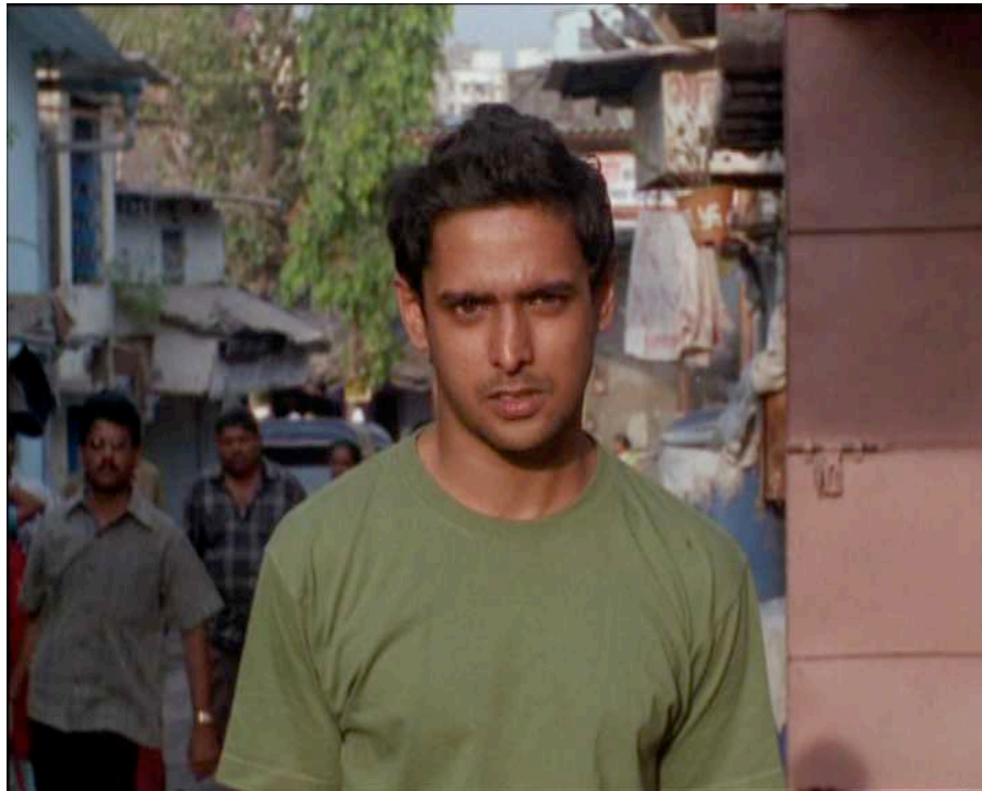
Captured still from The Exception and the Rule 'Performer, Audience, Mirror' sequence

In this performance Graham is foregrounding awareness in the viewer of their own perceptual process while at the same time the stages he passes through show the difficulty he is having in representing a pure present tense thought. My experience of this performance on video led me in India to create a performance sited solely for the camera. This was staged in India with a passer by outside of the gallery context. My aim became to create a social commentary on the environment in which this action was taking place that included the power dynamic between the performer and the camera. In the most successful version I had a friend face the camera in Gandhi bazaar and describe what they could see and by consequence what the camera cannot see. The performer became the camera allowing the audience to experience the perceptual process of this camera performing.