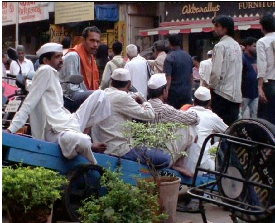
Captured still from The Exception and the Rule Looking and Listening sequence