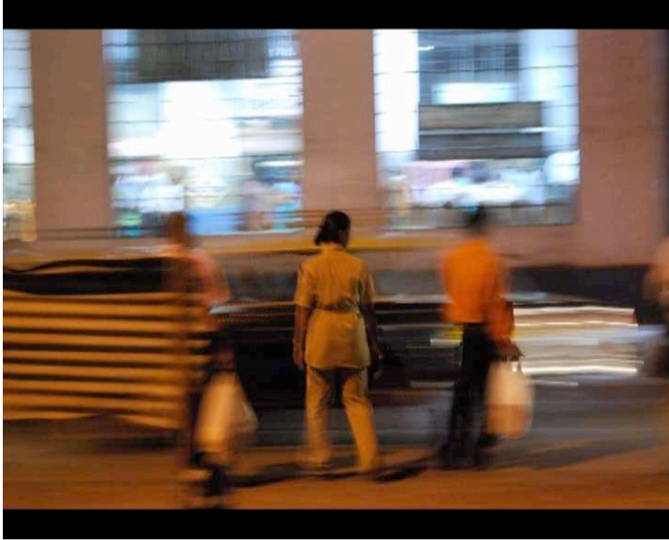
Captured still from The Exception and the Rule Following piece sequence

(Weiner, 1968) would create images in the viewer's mind's eye that need not be filmed. Rather they would exist in the gaps inherent in language. While 'Boston New York Exchange Shape' (Huebler 1968) offers a way of selecting and documenting locations with a camera while simultaneously removing aesthetic decision making from the photographic records. I have also recently become interested in 'Following Piece' (Acconci 1969) and wonder whether this could be integrated into anthropology?