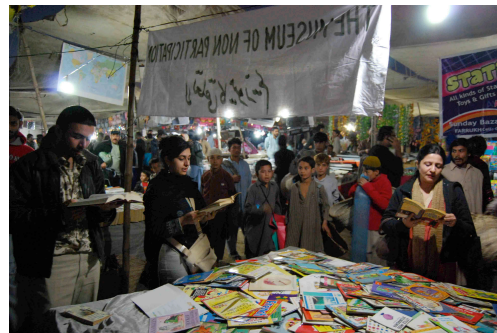
Image control and authority

preparation for debates to be held publicly in Karachi. My thesis research question was directly addressed in the topic Image control and authority .