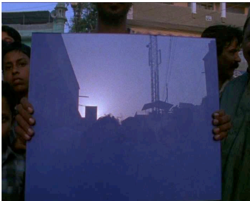
Screen grab from camera roll: The Autonomous Object?

These references were utilised in The Autonomous Object? when passers-by were asked to hold a colour card (sometimes with glass) towards the camera rather than a mirror. This shifted the spatial relationships within the camera frame. The eye is drawn to "reality" around the monochrome exaggerating the spatial expansiveness of the mirror. Despite the fact that the monochrome images are of equal representational value to the mirror performances, the viewer is held out of the full illusionist depth of three dimensionality. The monochrome breaks from photography as a preserve of evidential authority and illusion, a disturbance in the viewer's predisposition to subconsciously collude with the raw realism of moving images discussed in relation to Collier in Chapter 1 and Augé and Metz in Chapter 2. They consider that to experience cinema is to lower the ego's auto-defences by a notch.