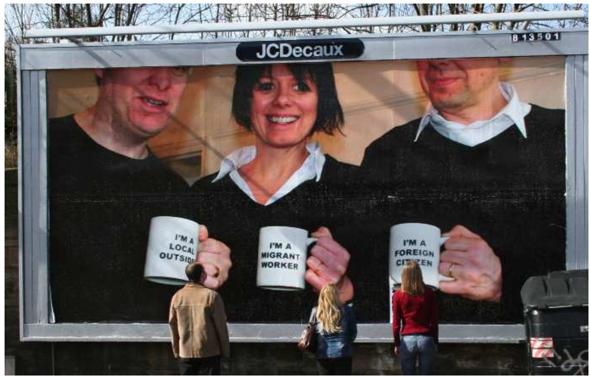
Fig. 11. I'm a Local Outsider, I'm a Migrant Worker, I'm a Foreign Citizen for 'How To Be Hospitable', volunteers and billboard poster, Edinburgh, Freee, 2008. Fig. 12. Volunteers for 'How To Be Hospitable', Edinburgh, Freee, 2008