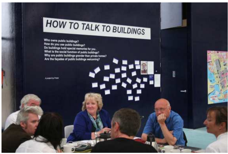
Fig. 21. How To Talk To Buildings, documentation of a workshop, ARC, Hull, UK, 2005.