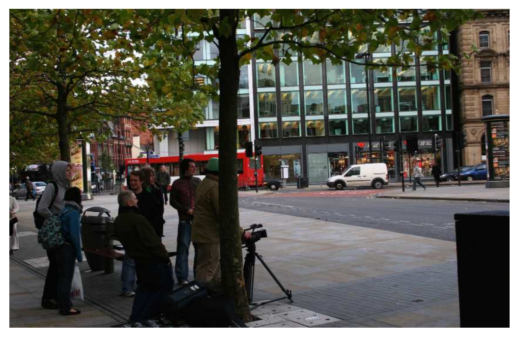
Fig. 16. How To Talk to Public Art, documentation of production, 2006.