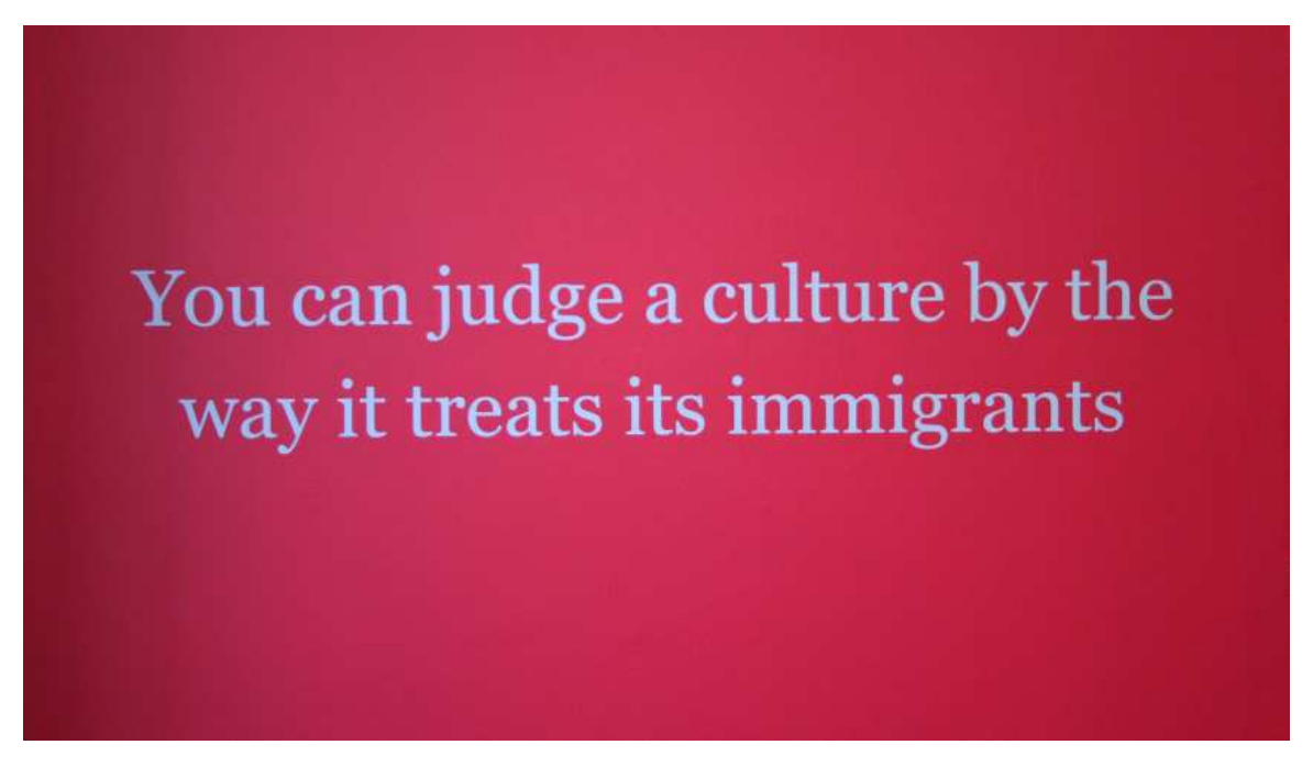
Fig. 7. You can judge a culture by the way it treats its immigrants, for 'How To Be Hospitable', Collective Gallery, Edinburgh, vinyl text, Freee, 2008.