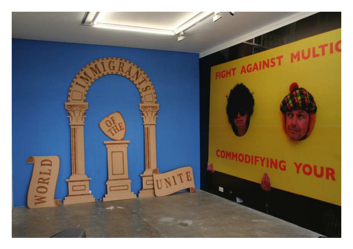
Fig. 8. Immigrants of the World Unite , for 'How To Be Hospitable', Collective Gallery, Edinburgh, Freee, 2008.