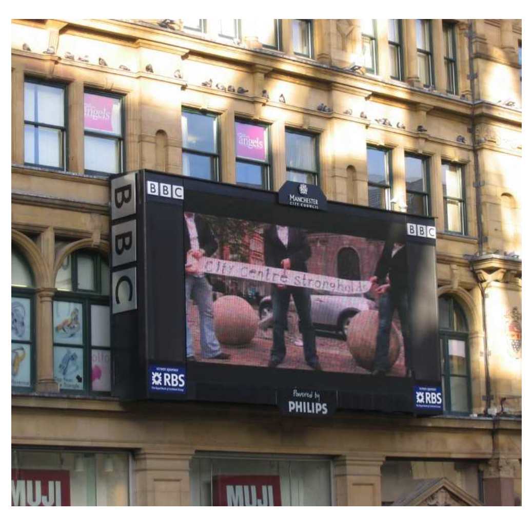
Fig. 19. How To Talk to Public Art, showing on the BBC big screen, Manchester City Centre, 2006.