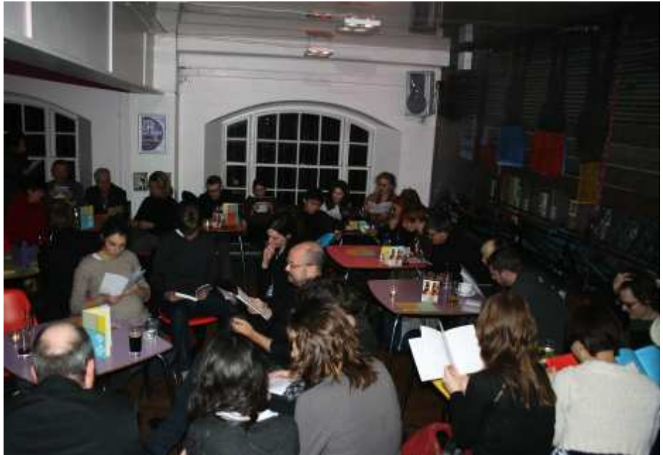
Fig. 25. Reading of The Freee Manifesto for Guerrilla Advertizing (After the Revolution) , with Freee billboard poster, Advertizing For All, Or Nobody At All, Reclaim Public Opinion , Institute of Contemporary Art, Freee, January 2009.