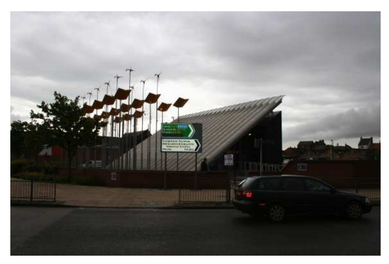
Fig. 20. ARC building, Hull, UK. 2005.