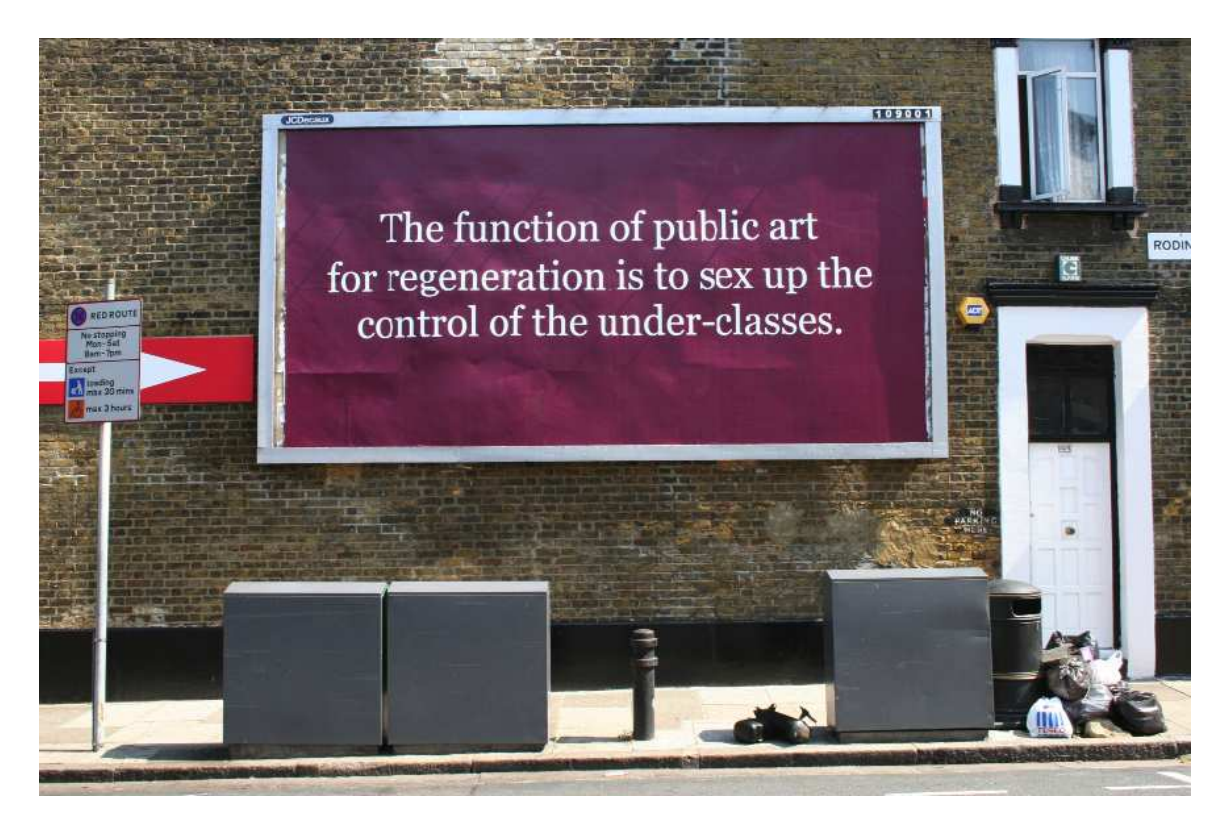
Fig. 2. The Function of Public Art for Regeneration is to Sex Up the Control of the Under-class , Homerton High Street, Hackney, London, August 2005. 'For Real Estate: Art in a Changing City', curated by B+B, as part of 'London in Six Easy Steps', Institute of Contemporary Art, London. Freee, 2005.