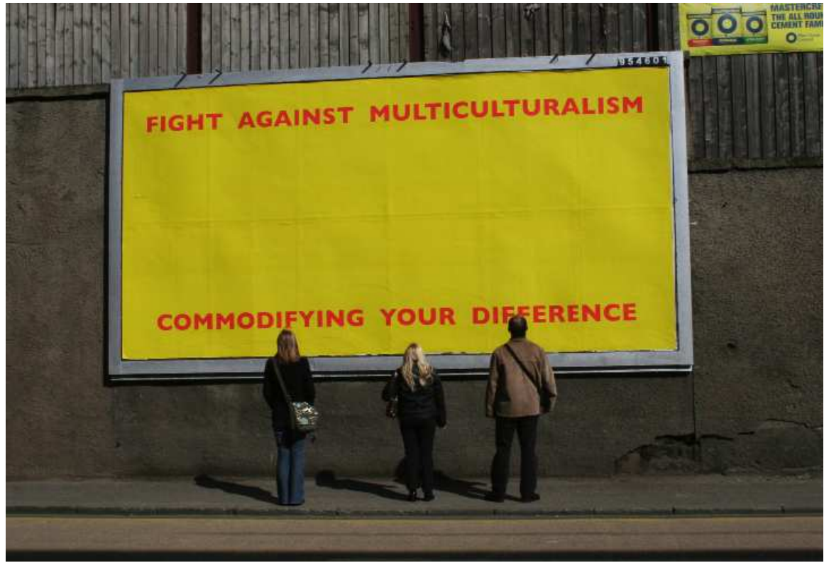
Fig. 13. Fight Against Multiculturalism Commodifying your Difference, for 'How To Be Hospitable', Collective Gallery, billboard poster, Freee, 2008.