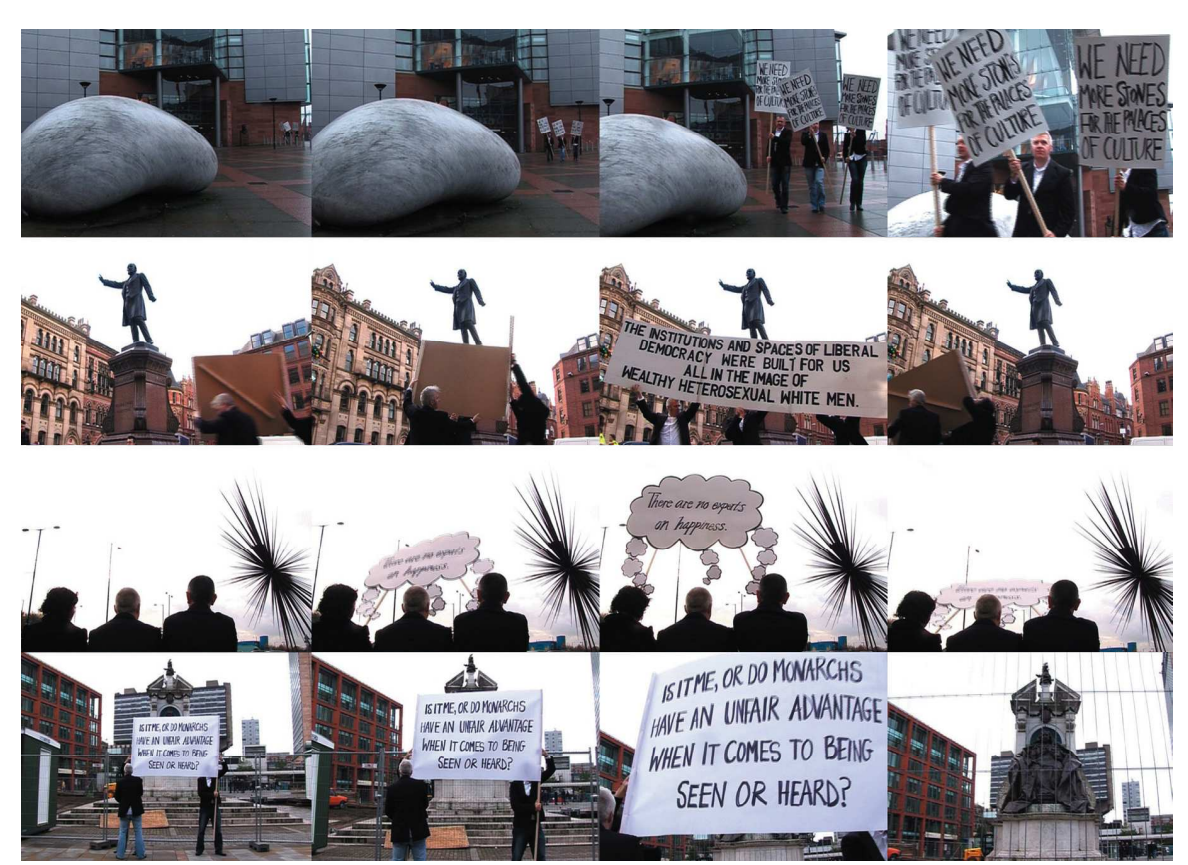
Fig. 15. How To Talk to Public Art, compilation of video stills, Freee, 2006.