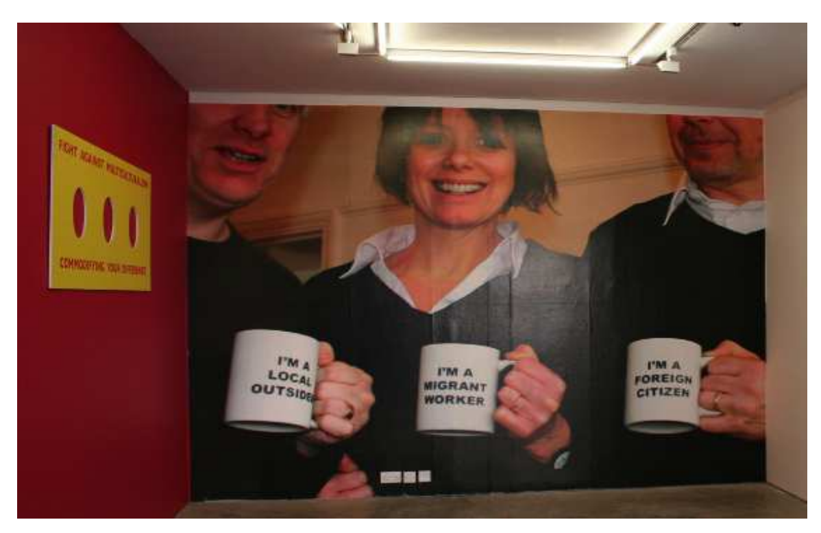
Fig. 5. I' m a Local Outsider , I'm a Migrant Worker , I'm a Foreign Citizen , for 'How To Be Hospitable', Collective Gallery, Edinburgh, billboard poster, Freee, 2008.