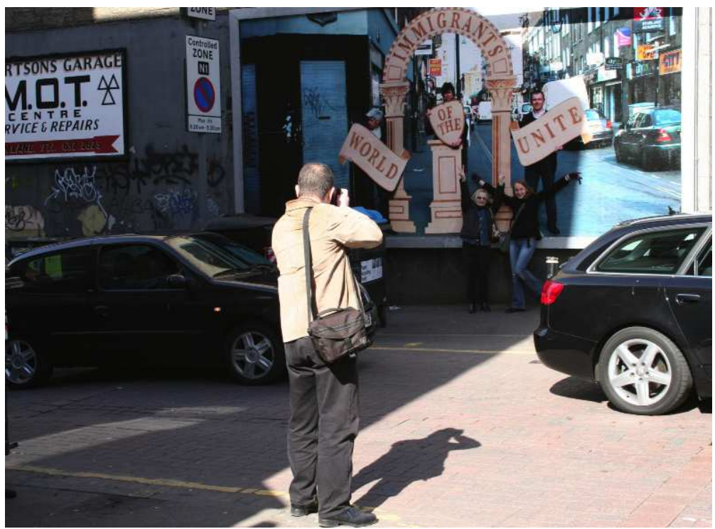
Fig. 10. Immigrants of the World Unite, for 'How To Be Hospitable', volunteers and billboard poster, Edinburgh, Freee, 2008.