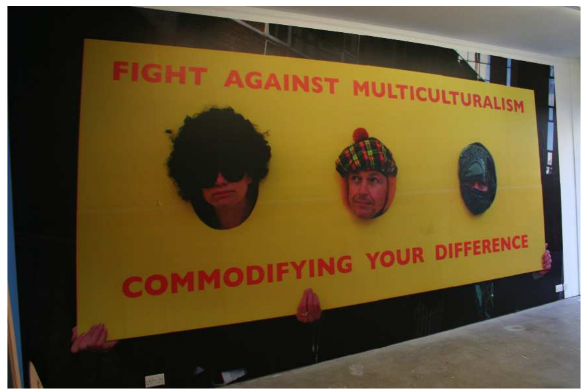
Fig. 6. Fight Against Multiculturalism Commodifying your Difference, for 'How To Be Hospitable', Collective Gallery, billboard poster, Freee, 2008.