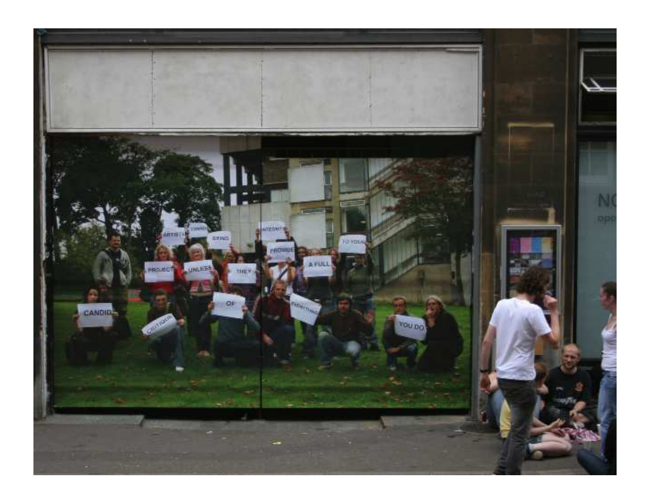
Fig. 4. Artists cannot bring integrity to your project unless they provide a full and candid critique of everything you do, Norwich, For EAST 2006, Freee, 2006.