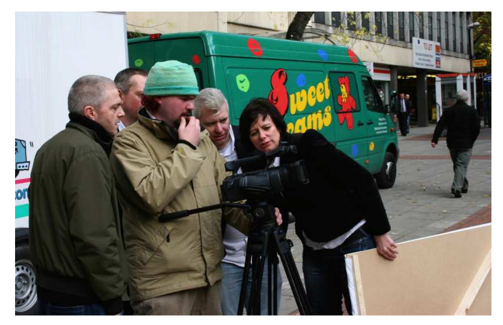
Fig. 18. How To Talk to Public Art, documentation of production, 2006.