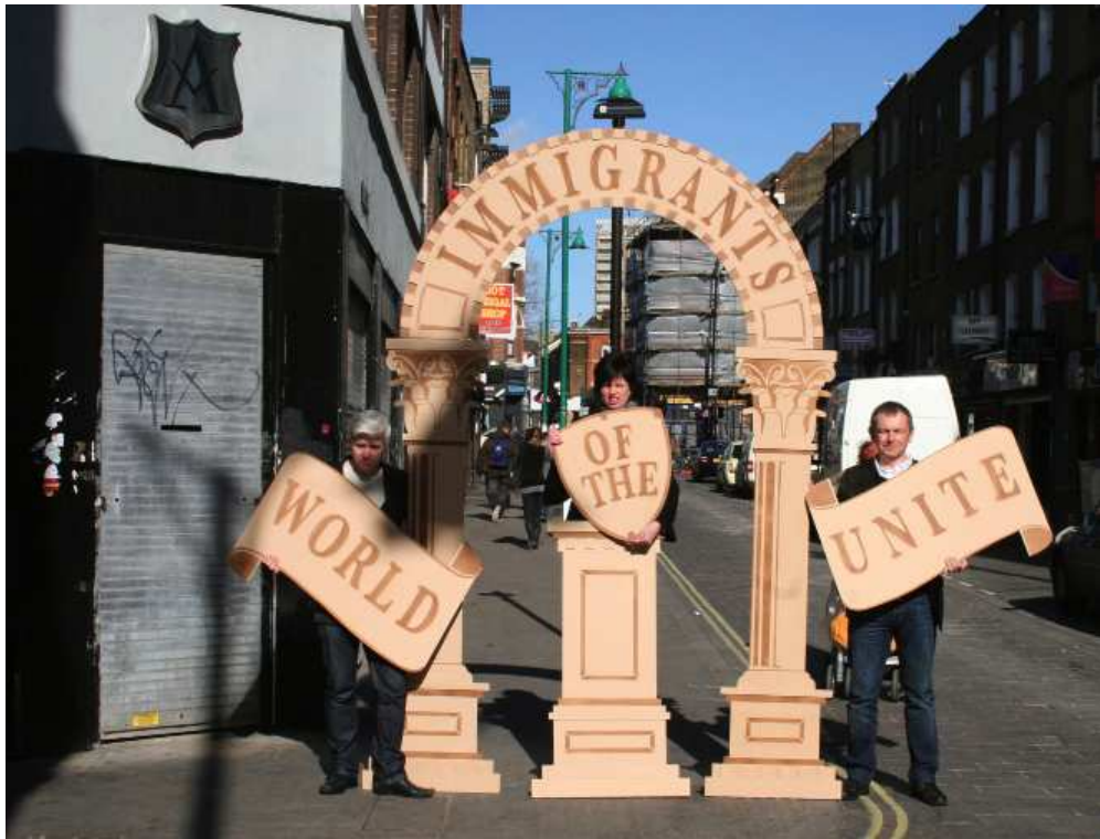
Fig. 9. Immigrants of the World Unite , for 'How To Be Hospitable', Brick Lane, London, Freee, 2008.