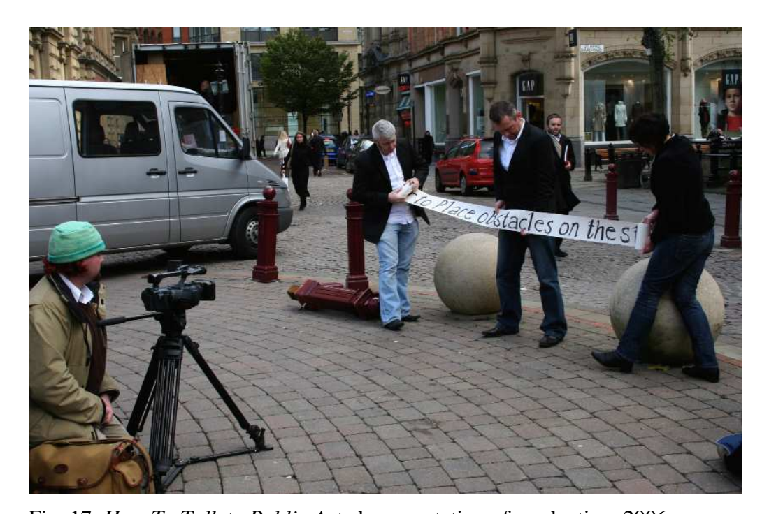
Fig. 17. How To Talk to Public Art, documentation of production, 2006.