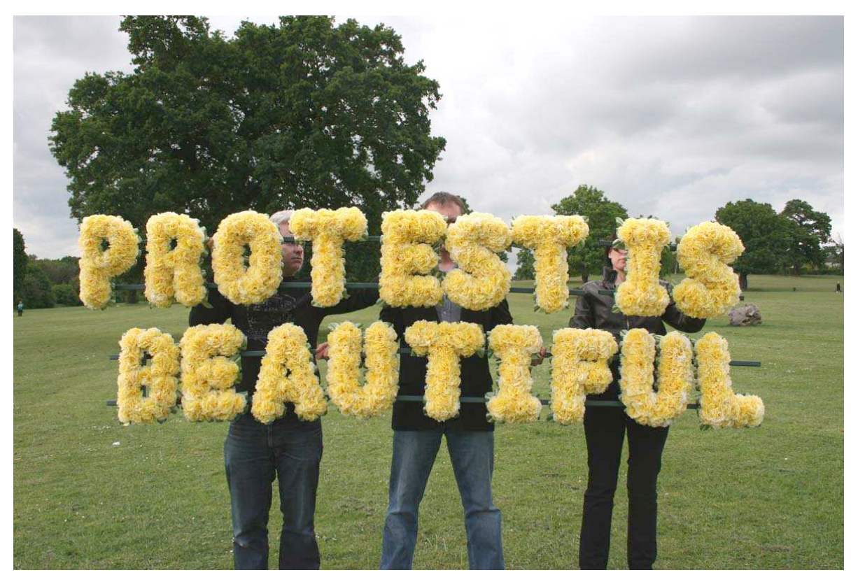
Fig. 27. Protest is Beautiful, Freee, 2007.