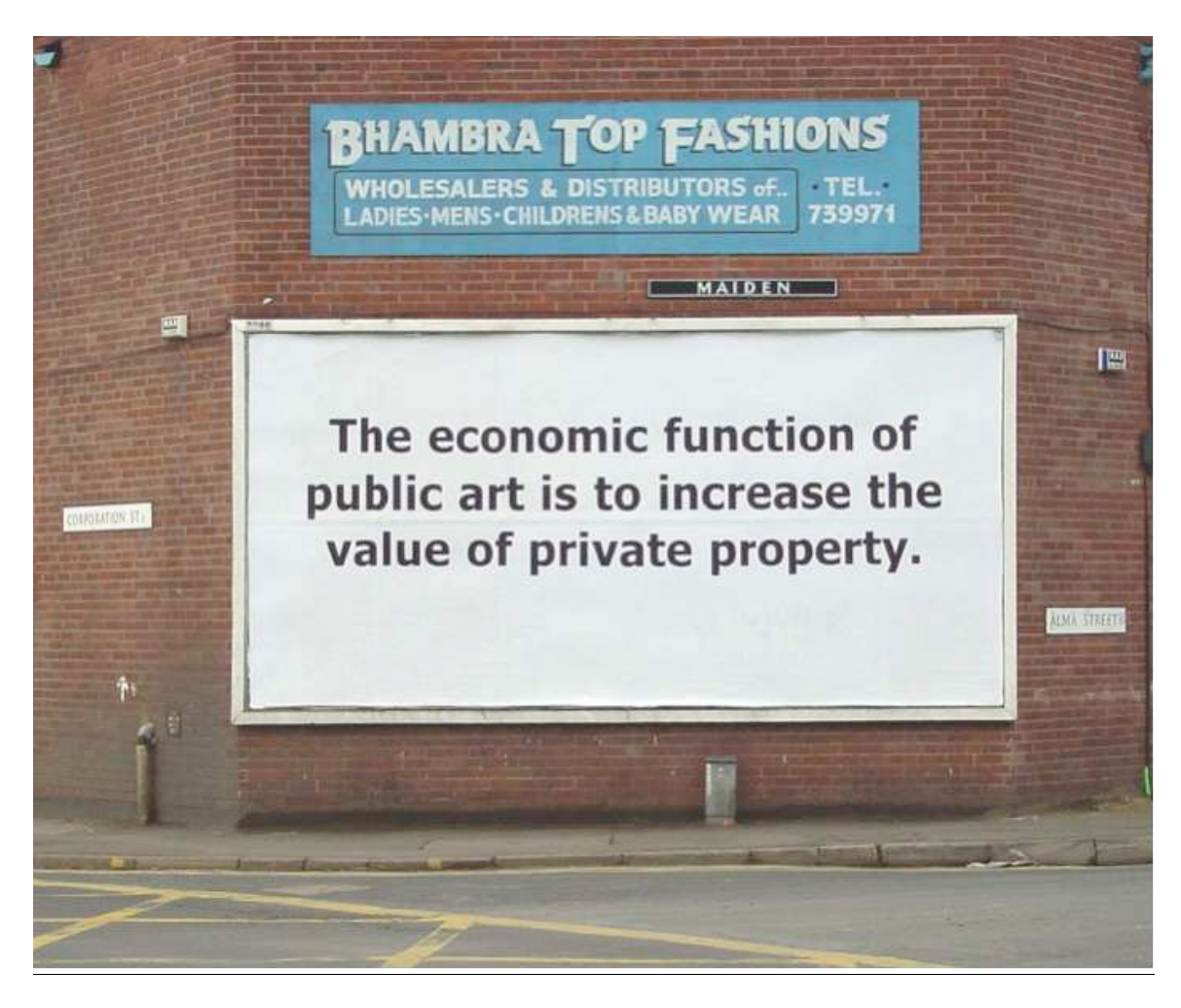
Fig.1. The Economic Function of Public Art is to Increase the Value of Private Property , Sheffield, Commissioned by Public Art Forum, Freee, 2004.