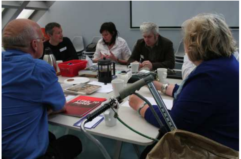
Fig. 22. Freee at a workshop meeting for How To Talk To Buildings, ARC, Hull, UK, 2005.