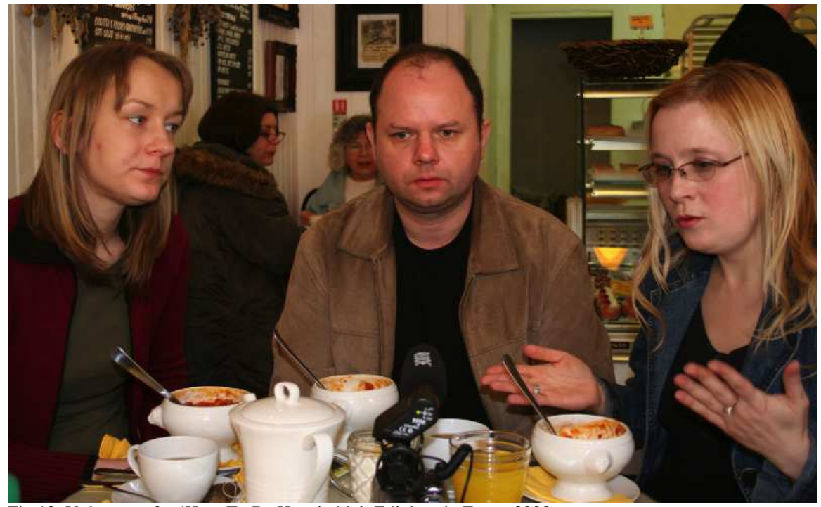
Fig.12. Volunteers for 'How To Be Hospitable', Edinburgh, Freee, 2008