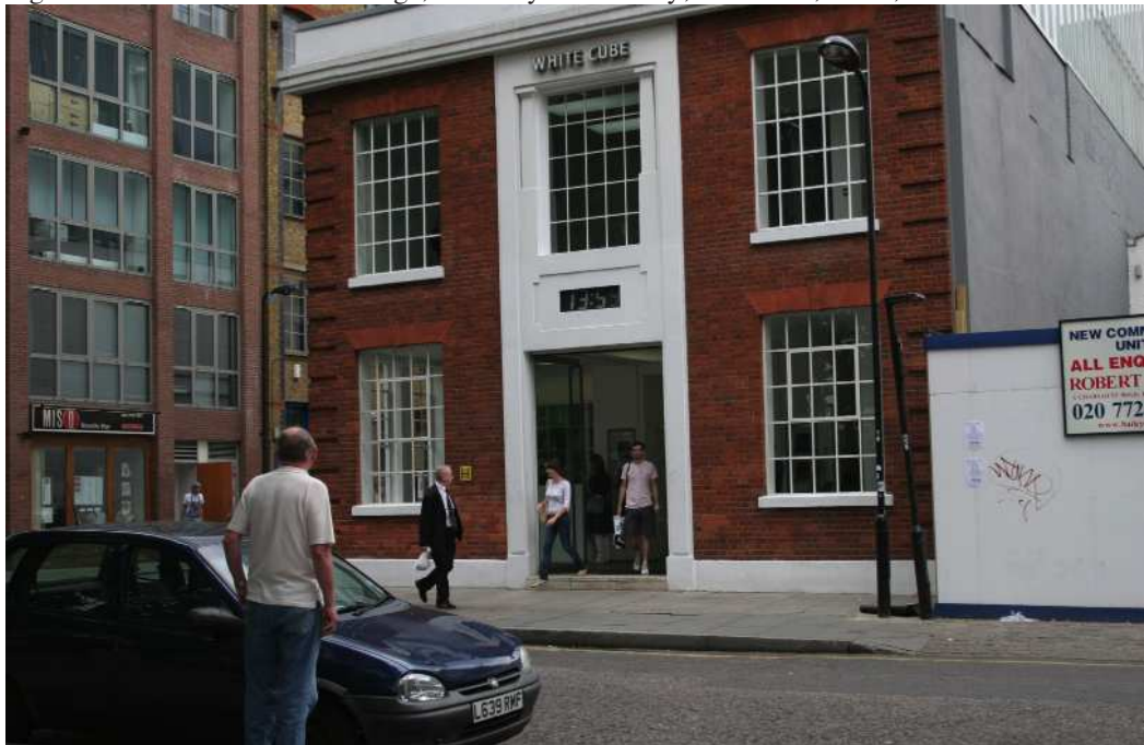
Fig. 24. How To Talk To Buildings , White Cube gallery, formerly The London Electricity Board Building, Hoxton Square, video still, 2005

Fig. 23. How To Talk To Buildings, Hull Royal Infirmary, video still, Freee, 2005