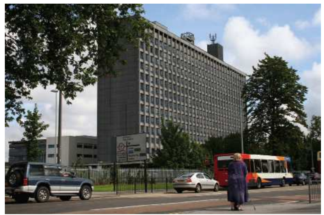
Fig. 23. How To Talk To Buildings, Hull Royal Infirmary, video still, Freee, 2005