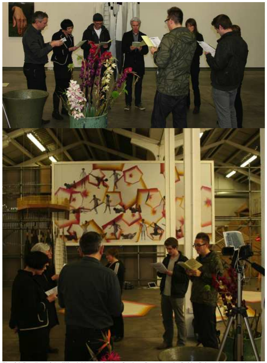
Fig. 26. Reading of the Whistleblowers Pocket Guide to Dissent in the Public Sphere , incorporating 'Let's Build' and 'Fuck Globalization', by Freee and volunteers at Eastside Projects, October 2010.