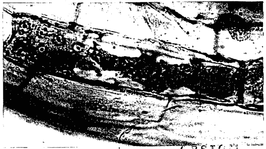
Fig. 1. Multinucleate plasmodium of Polymyxa graminis in a root cell of great millet ( Sorghum arundinaceum ).

Host plants. One or more stages of the fungus in soil with infected S. arundinaceum roots were observed on the following plant species: S. arundinaceum , S. cernuum Host., S. dochna (Forsk.) Snowden var. technicum (Koern.) Snowden, S. sudanense Hitchc., S. verticilliflorum (Steud.) Stapf, S. vulgare Pers., Avena sativa L. 'Maris'