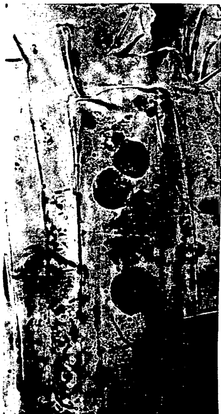
Fig. 2. Meront-formation by division of the plasmodium of Polymyxa graminis .

Tabard, Hordeum vulgare L. 'Alpha' and 'Cape barley,' Triticum aestivum L. 'Michigan Amber,' and T. durum Desf. 'Agathe' and 3467-7.