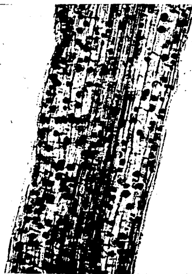
Fig. 3. Resting spores of Polymyxa graminis in a rootlet of Sorghum arundinaceum .

Polymyxa spp. are characterized especially by resting spores of indefinite size and shape and zoosporangia with one or more discharge tubes. The entire life cycle of the fungus in great millet roots is similar to that of P. graminis on wheat (10, 13). Cystosori resting spores and zoospores are the same size. Moreover, the fungus in S. arundinaceum can infect wheat and barley, which are the main hosts for P. graminis . Oats also are infected (7). We conclude that P. graminis is also parasitic and can reproduce on the six Sorghum spp. tested. The life cycle of the fungus is completed faster than described by Rao (13). Resting spores could be seen in Sorghum in 10-12 days instead of 21-28 days. High ambient temperatures apparently accelerate the growth