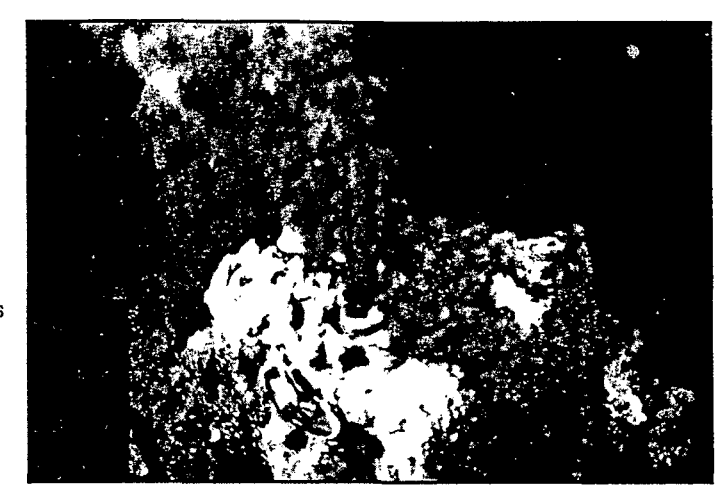
Figure 3. Active hydrothermal site with black smokers at 17°25'S. The measured temperature of the water is 318°C.

intense fissuring. Open fissures, some meters wide, are extremely common. Some of them separate small horsts that are only a few meters wide and 10 meters high. These very fragile features are locally tilted. The observed volcanic formations include chaotic, brecciated, draped lavas outside of the axial graben, thick pillow lava formations at the edge of the graben and collapsed lava lakes with up to 10-15 m high relict pillars and associated pillows in the central graben.