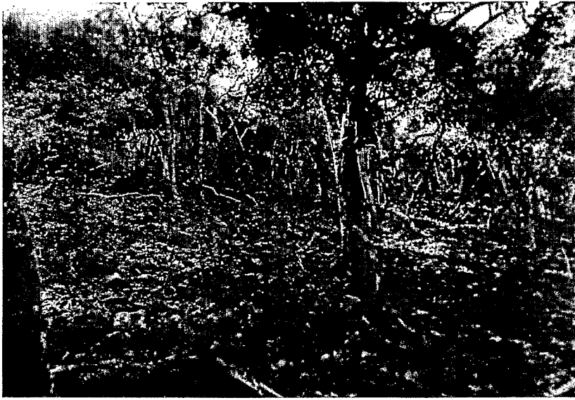
Figure 4. The sclerophyll forest patch on Leprédour Island where the extinct Pittosporum taniaum occurred. The absence of regeneration because of grazing by introduced deer and rabbits is evident from the ground bare on most of the island, a 'protected' area.

propagation was attempted by cuttings, but this failed. During a later visit to Leprédour in 1992, it was found that one plant had died as soil had eroded away around the tree. The second plant died between June 1992 and July 1993 from unknown causes.