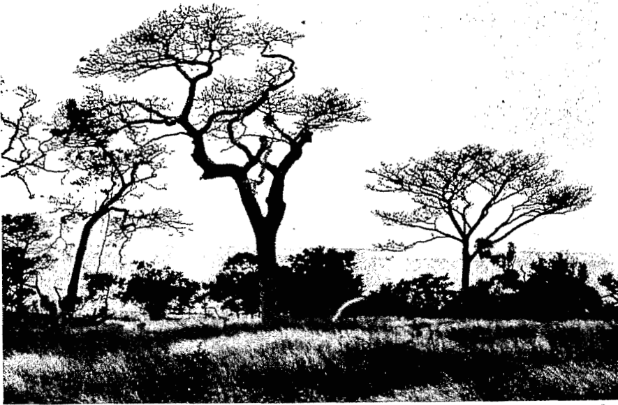
Figure 2. View of cleared sclerophyll forest. Only a few canopy trees have been retained to provide shade for cattle, but these are now very vulnerable to cyclones. Grazing by cattle prevents regeneration. The canopy trees are Terminalia cherrieri , endemic to the Poya area on the west coast of New Caledonia, where about 500–1000 specimens remain.

when vast stretches of Acacia bush were destroyed. The edges of the remaining sclerophyll forests there (one of the largest remaining fragments, occupying several hundred hectares) were damaged as well, making the forest still more vulnerable to border effects. Except in the greater Nouméa area, bush fires are not controlled and may burn for weeks in the sparsely inhabited hills, causing extensive damage to alien and native plant formations.