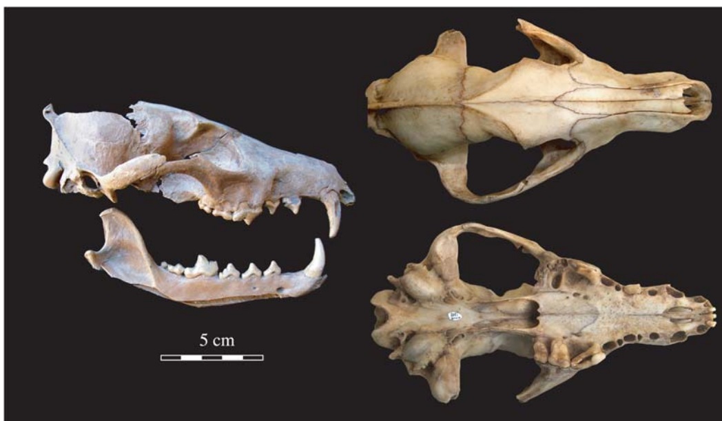
Figure 6. Zorros —Andean foxes. Skull of Lycalopex sp. of Jatun Uchco (left MUSM 679) in lateral view and one from Cueva Roselló (right, MUSM 1383) in dorsal and ventral views.

unable to obtain collagen from † Diabolotherium specimens of Jatun Uchco (or any other samples attempted from that locality), but organics were recovered from a Trigo Jirka specimen of † Diabolotherium .