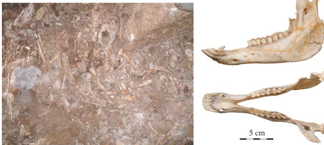
Figure 7. Cueva Roselló . Photo (left) of the floor of cave illustrates the concentrations of fossils. Most shown are those of Vicugna sp. Jaw of Vicugna sp. (right, MUSM 1387).

ing such cliffs and the elevations of the entrances would have made it difficult for carnivores to carry prey items to such heights along steep rock surfaces. Cueva Roselló , however, is located on the Altiplano, the high plains between the eastern and western ranges of the Andes. Such relatively flat terrain would have allowed ungulates close proximity to the cave. As previously mentioned, we think