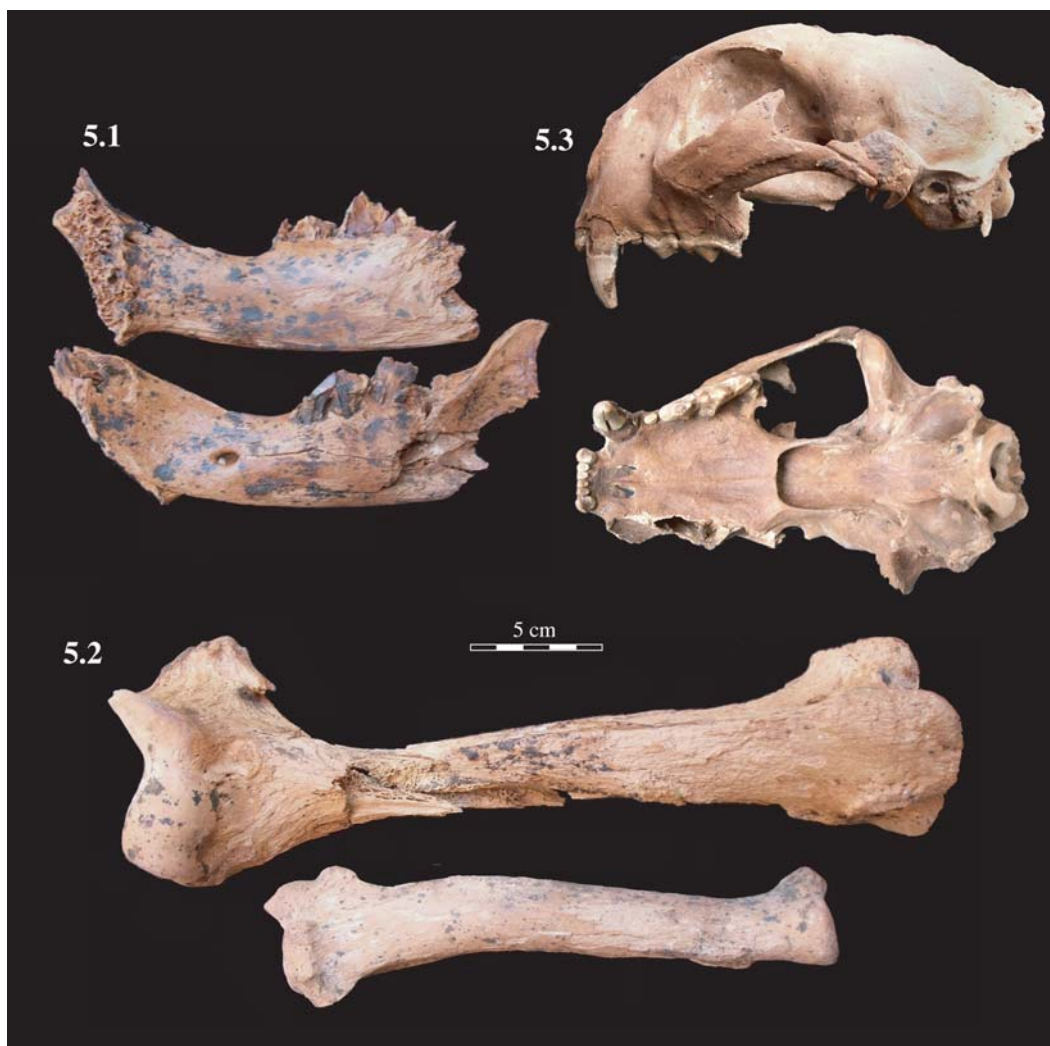
Figure 5. Felids of Jatun Uchco. Jaws (5.1) and left humerus and radius (5.2) of † Smilodon populator and skull (5.3) of Puma sp., cf. Puma concolor . Scale bar = 5 cm.

of the pollen is that of Alnus sp., the Andean alder of the birch family, Betulaceae. There were also many spores of club moss ( Lycopodium ), ferns, and fungi.