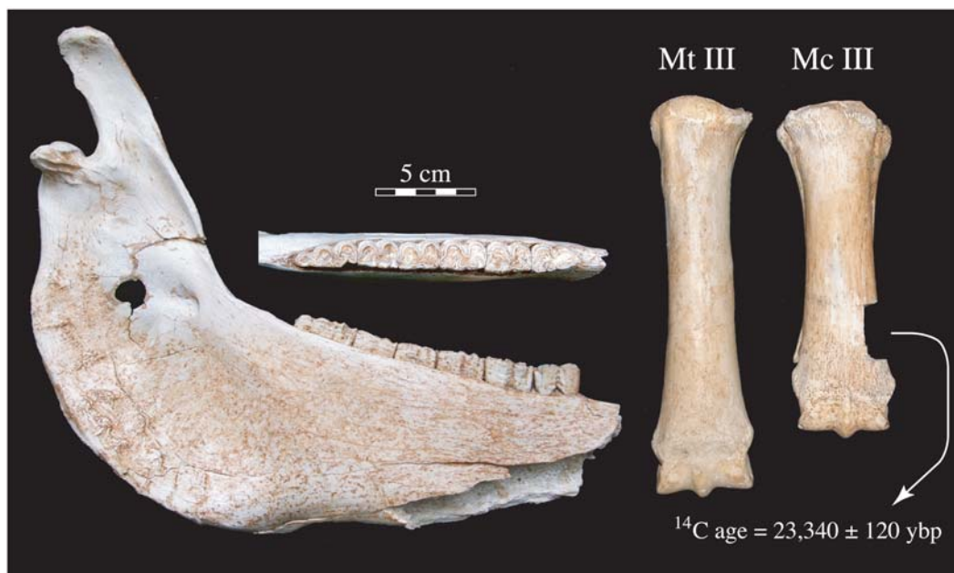
Figure 8. Extinct horse Onohippidium devillei . Mandible (left), (MUSM 613) and metapodials. (The metacarpus shows where sample was removed for radiocarbon dating.)

The most common remains of any mammal at Cueva Roselló were those of vicuña ( Vicugna sp.)