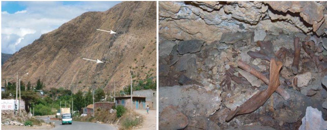
Figure 2. Jatun Uchco of Ambo, Perú. Openings to upper and lower chambers of the caves of Jatun Uchco are indicated on the photo at left. Fossils were obtained by surface collection (right).

mil to yield the Conventional Radiocarbon Age (Stuiver and Polach 1977).