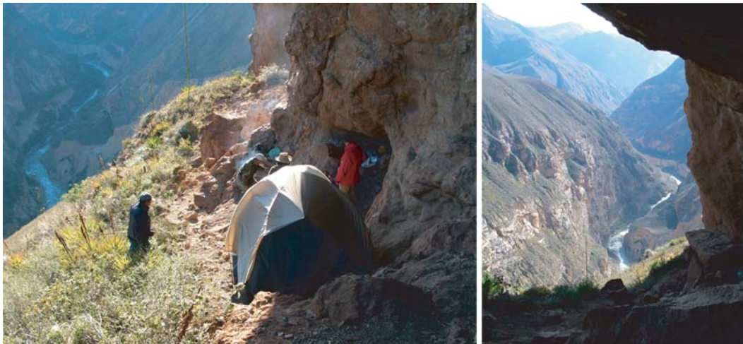
Figure 9. Trigo Jirka. Our camp (left) on the ledge beside the mouth of the cave at Trigo Jirka. The cave is about 300 m (about a 1,000 ft) above the Río Marañón (right, a view from mouth of the cave). The Marañón is a major tributary of the Amazon River.

(see Figure 7). Previously, it had been thought that vicuña did not migrate into high elevation regions of the Andes until less than 12,000 years ago (Wheeler et al. 1976; Hoffstetter 1986; Marín et al. 2007). However, our calibrated radiocarbon age of 22,220 \pm 130 BP from bone sample of vicuña along with that of 23,340 \pm 120 BP from a nearby (coeval or nearly so) ?Onohippidium devillei specimen strongly suggest that vicuña migrated to the central Andes about 10,000 years earlier than previously thought.