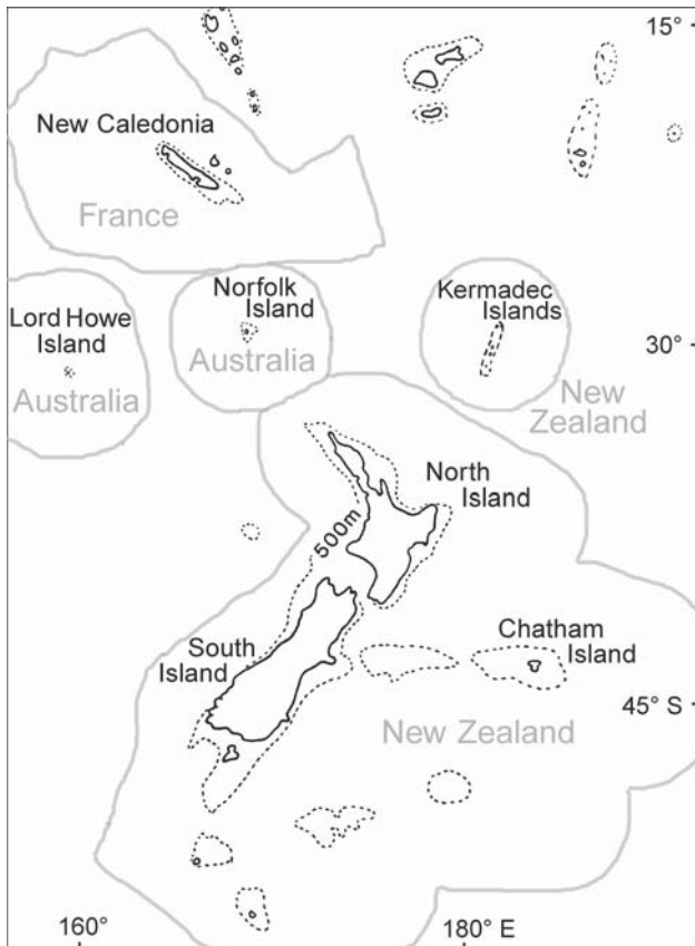
Fig. 1. Study area. The boundaries of the southwestern Pacific EEZs are indicated by grey lines.

The checklist also includes detailed information on the distribution of the species around southwestern Pacific island groups, including New Caledonian regions as well as the continued southerly ridges including Lord Howe Island, Norfolk Island and New Zealand. New Caledonia is abbreviated “NC”, Australia “AU”, New Zealand “NZ”; the regions are numbered 1–30 (Fig. 2); a number without brackets indicates a confirmed record from the region, a number in brackets indicates an expected distribution in the region without a confirmed record. The list also includes information on the general habitat (marine, transitional water or freshwater), and the depth range. The name ‘transitional water’ is used instead of ‘brackish water’ due to terminology in the European Water Framework Directive.