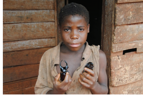
FIGURE 3: Baka child with a couple of Augosoma beetles.

However, the abundance of this insect varies from year to year and there is usually an outbreak of its population every two years. The larvae of the beetle, however, are available year-round and can be gathered whenever need be. The adults are harvested on electrified spots at night or on locally known Augosoma attracted (host) plant species like raffia ( Raphia sp.) and Pandanus ( Pandanus candelabrum ). Adults attracted to light are gathered by simple hand-picking when they settle on the ground or on objects around the electrified spots.