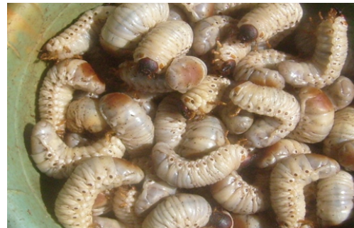
FIGURE 4: Stock of harvested Augosoma larvae.

Large amounts of adult Augosoma beetle are collected by this method, especially in forest logging areas where good public lamps have been installed by logging companies. In seasons of abundance, a single collector can fill a bucket of 5-liter capacity in a single night of effective gathering. The beetles are equally collected directly from their host plant species (raffia and Pandanus ). In this case, local people walk across the swampy forest of raffia or Pandanus and observe the buds and stems of the plants. Once a beetle is seen on a plant, it is collected by simple hand-picking (Figure 3).