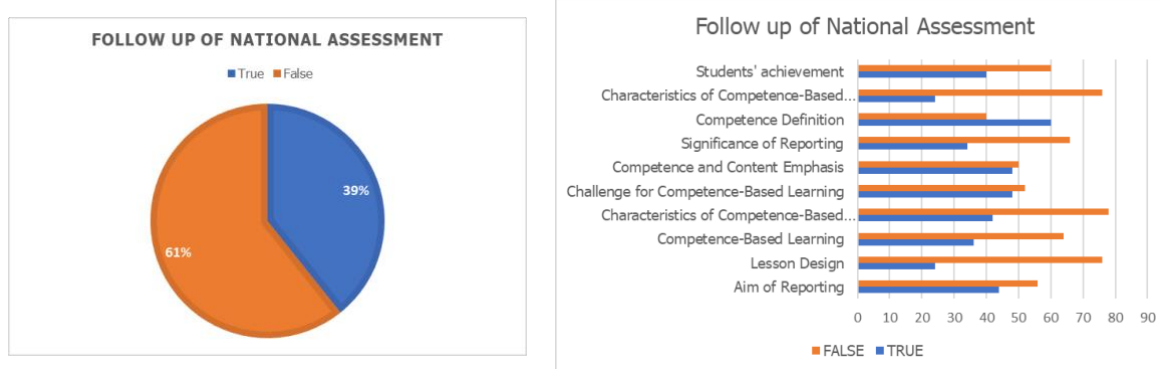
Figure 3. Percentage of national assessment follow up

Figure 3 presents the teacher's misconception on the follow up to the national assessment. It is clear that 61% in-service teachers improperly regarded the follow up to the national assessment.