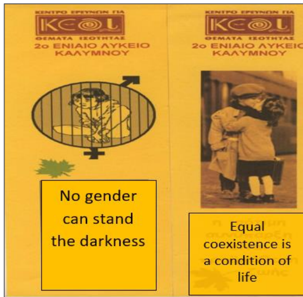
Figure 4. A poster from the 2 nd Lyceum of Kalymnos (modified).

Pupils create a poster, with the dominant conclusion, which they came to (Fig. 4).