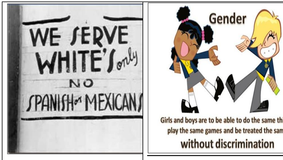
Figure 2. Gender stereotypes and discrimination (in Foulidi et al., 2020).