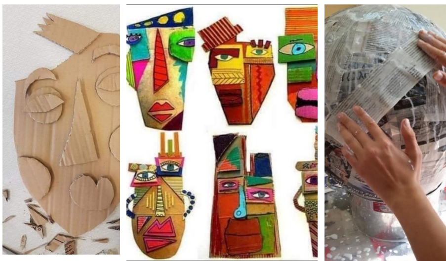
Figure 5. Different Faces.

share responsibilities for who will cut the nose, ears, etc., and who will paint or glue the pieces of the face. Through the implementation of this craft, pupils have the opportunity to experience diversity experientially and artistically, to create it, to use imagination, observation, fine and gross mobility, fine motion coordination, initiative, collaboration and above all to experience being equal and free to express their artistic view on the issue of “Different”. Different ideas, perceptions, choices for colors, designs, sizes, but with the common goal of creating a common work of a mask face that will include all the different features.