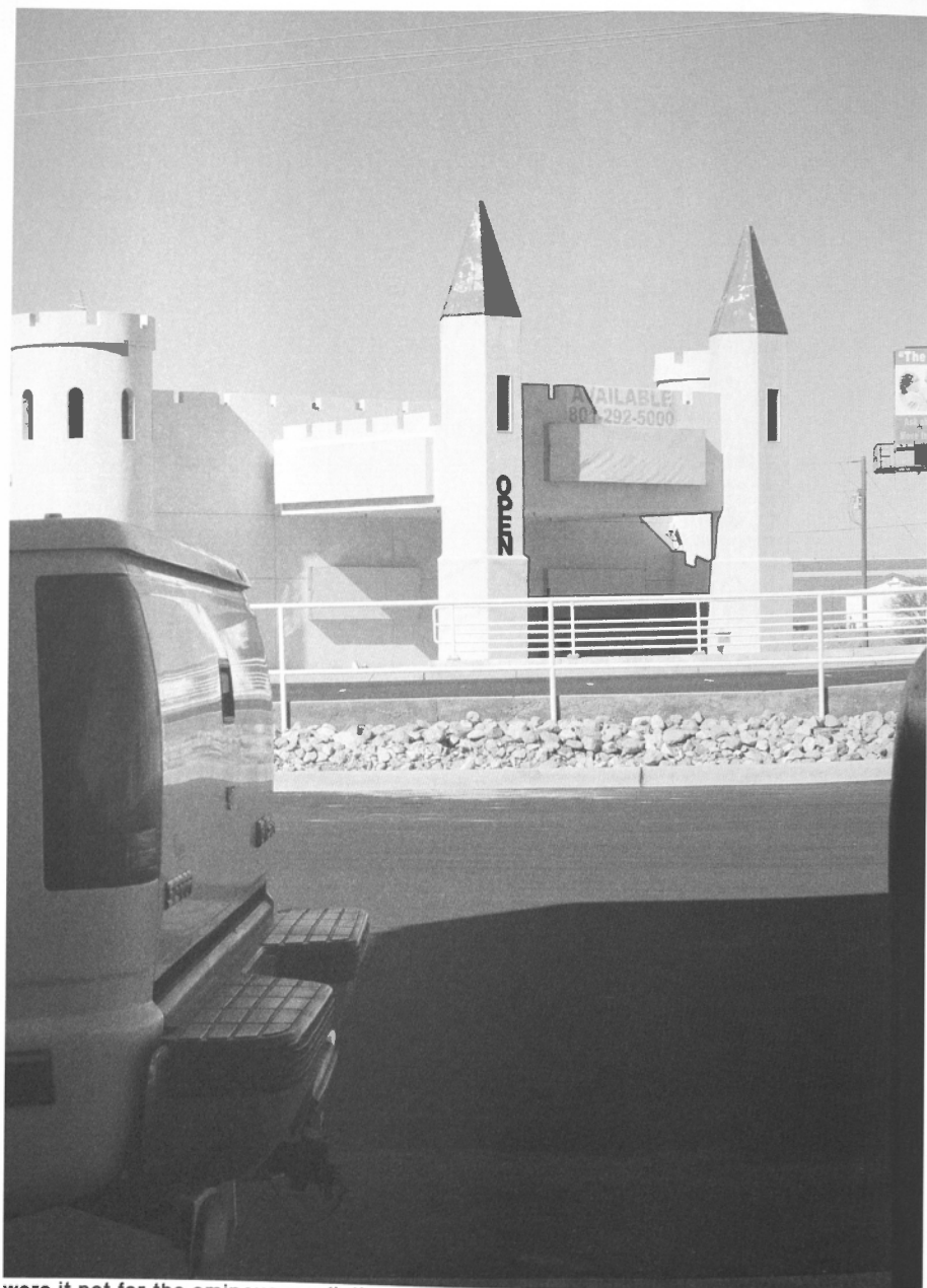
were it not for the ominous prediction