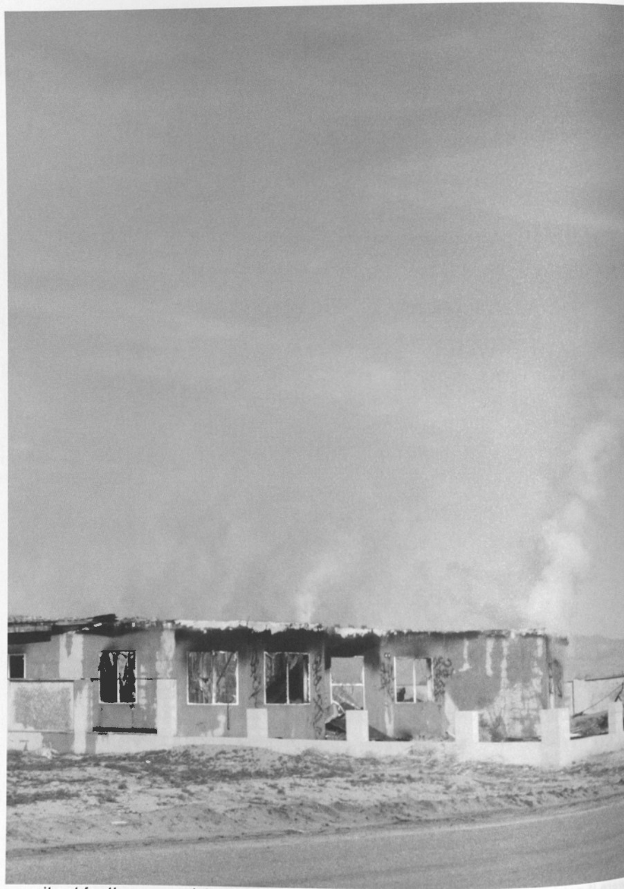
were it not for the communist cells