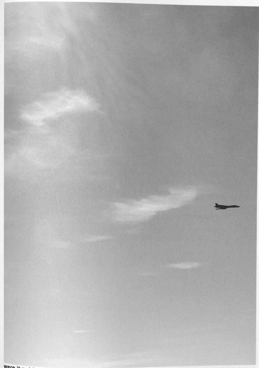
were it not for the red scare