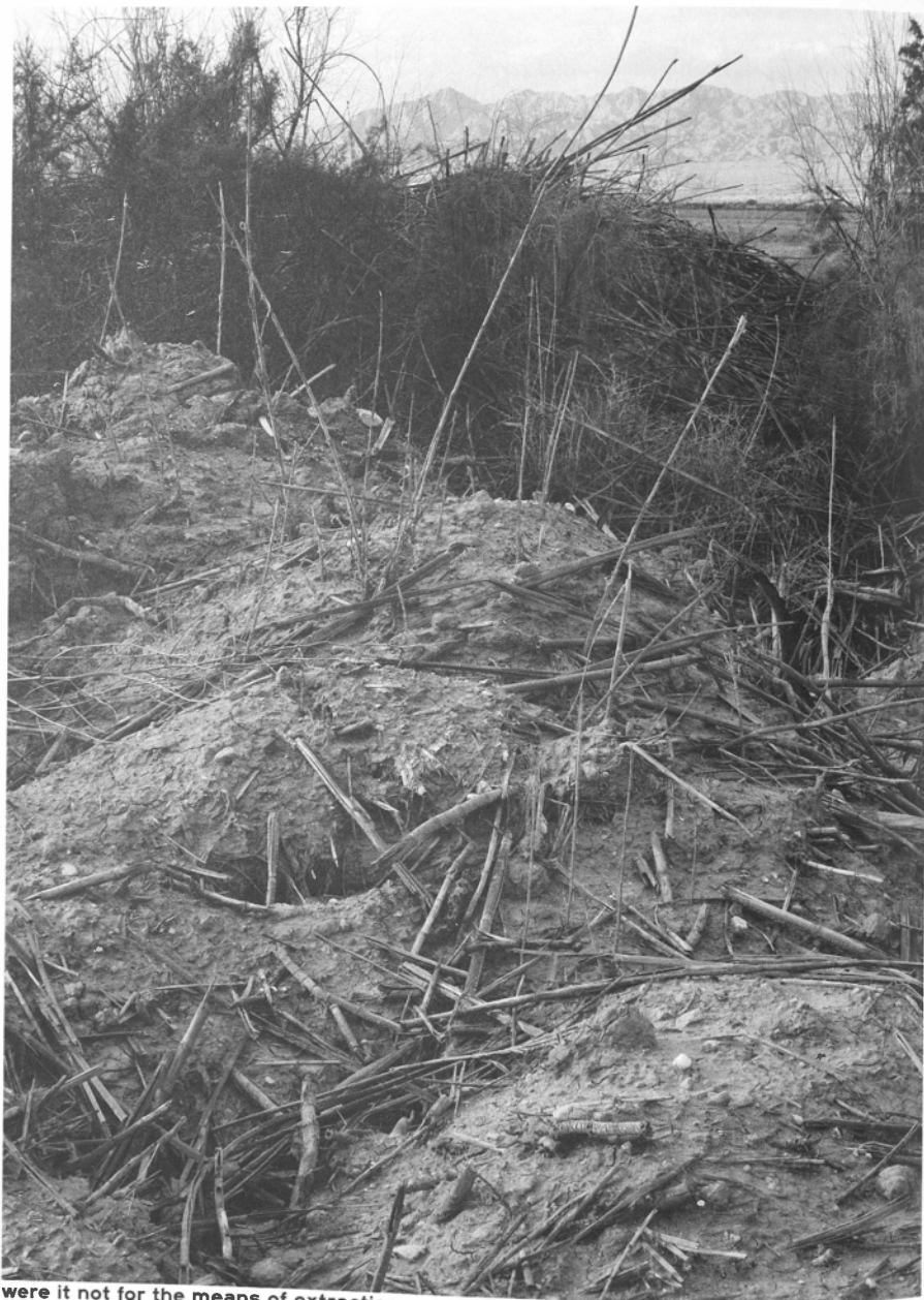
were it not for the means of extraction