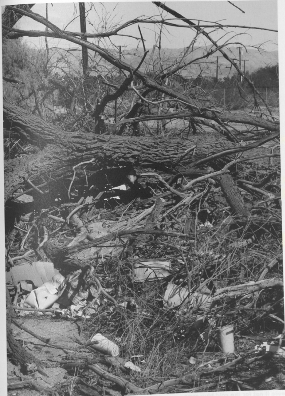
were it not for the cold earth