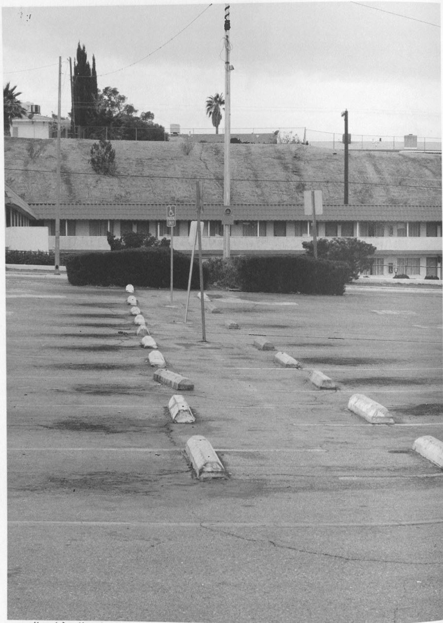
were it not for the death foretold