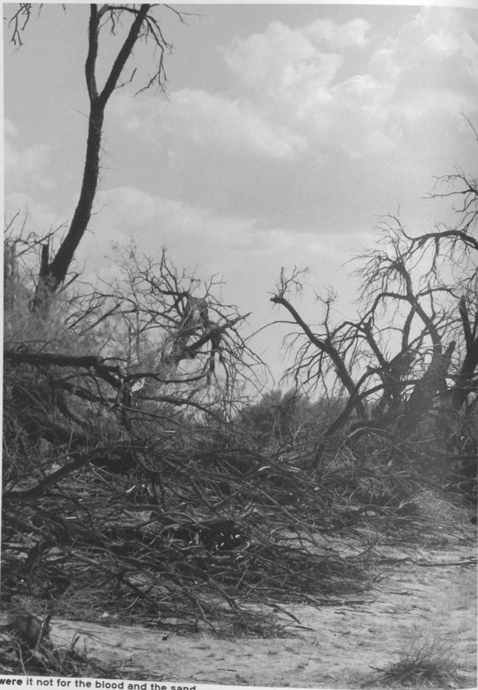
were it not for the blood and the sand