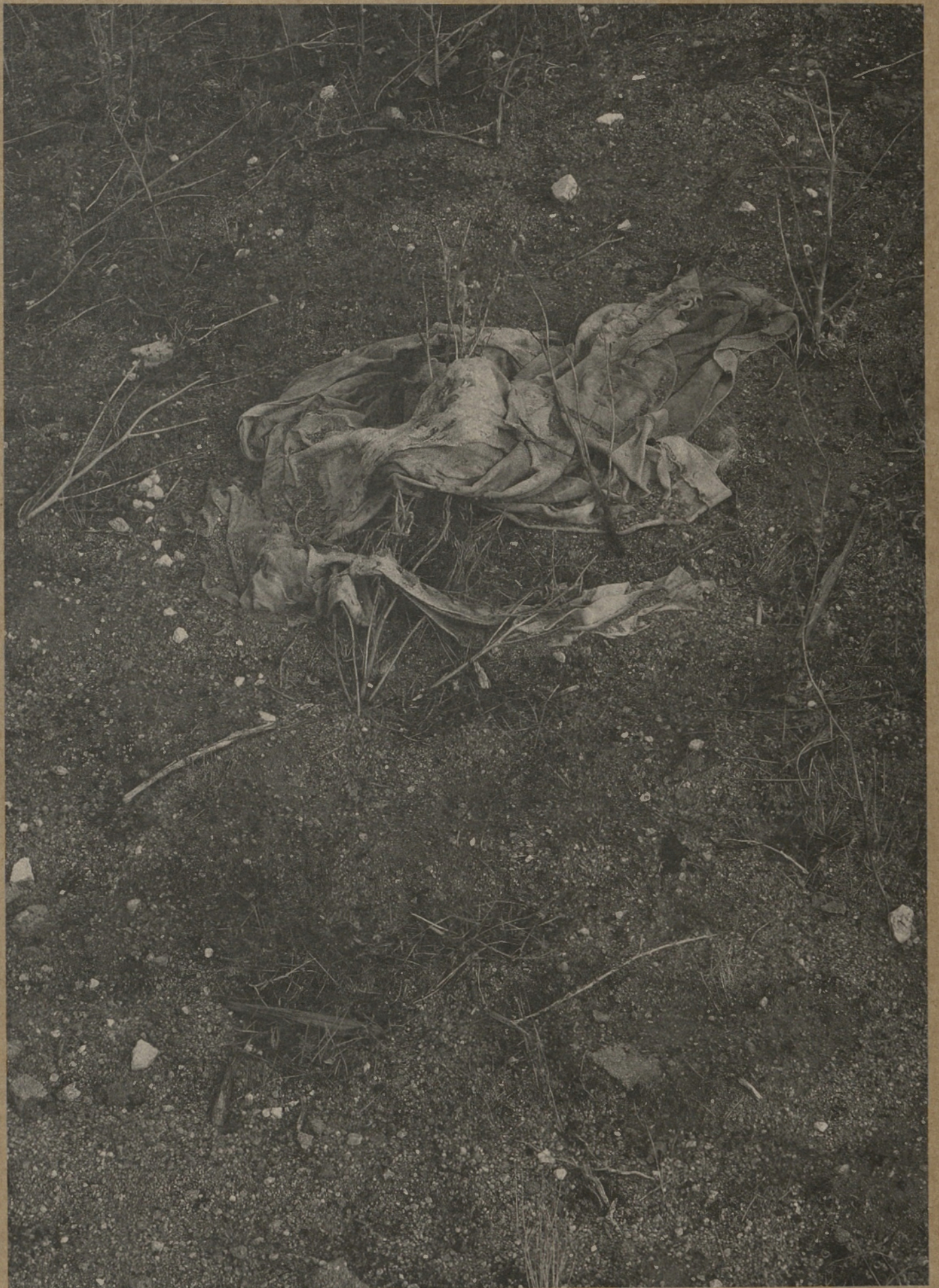
were it not for the dunes beyond the dunes