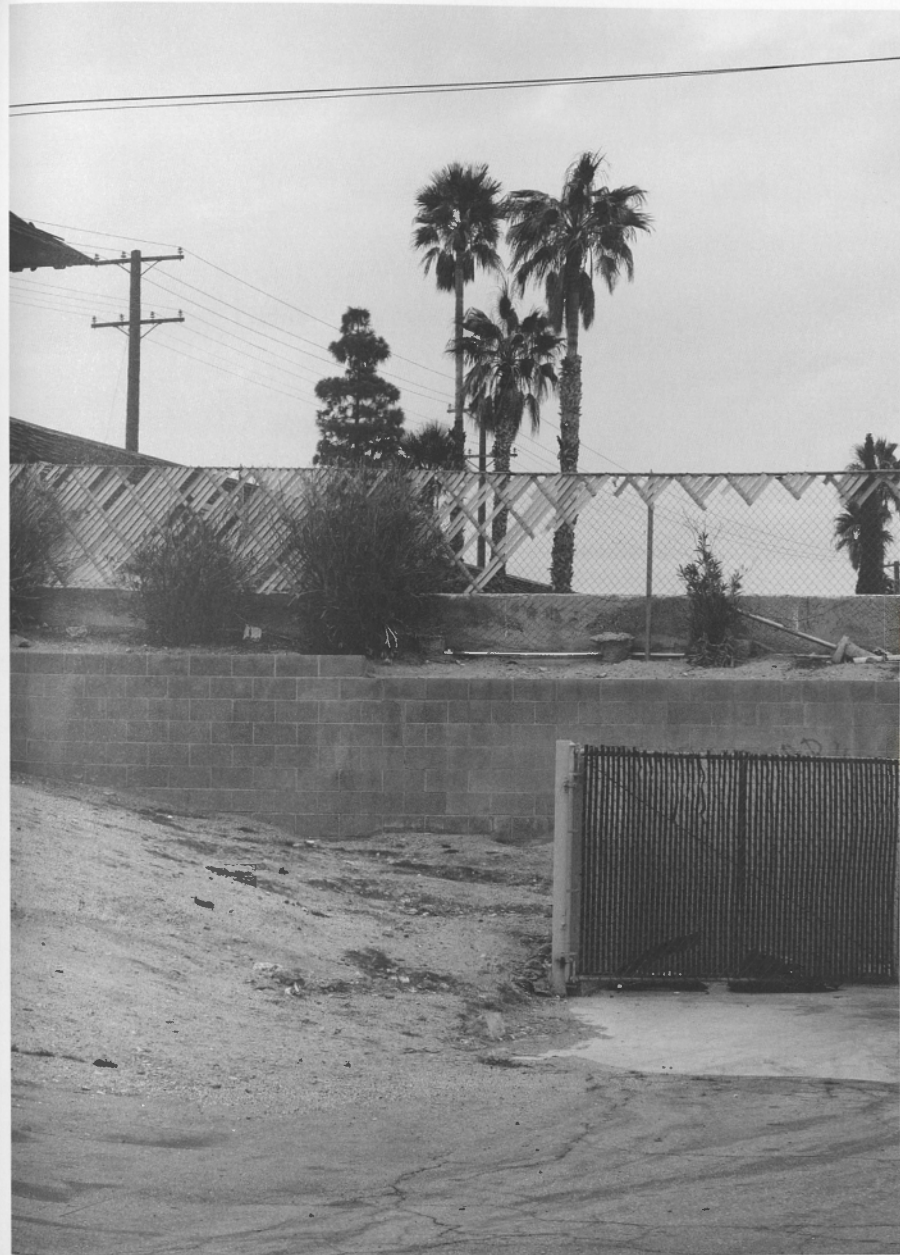
were it not for the words of the prophet