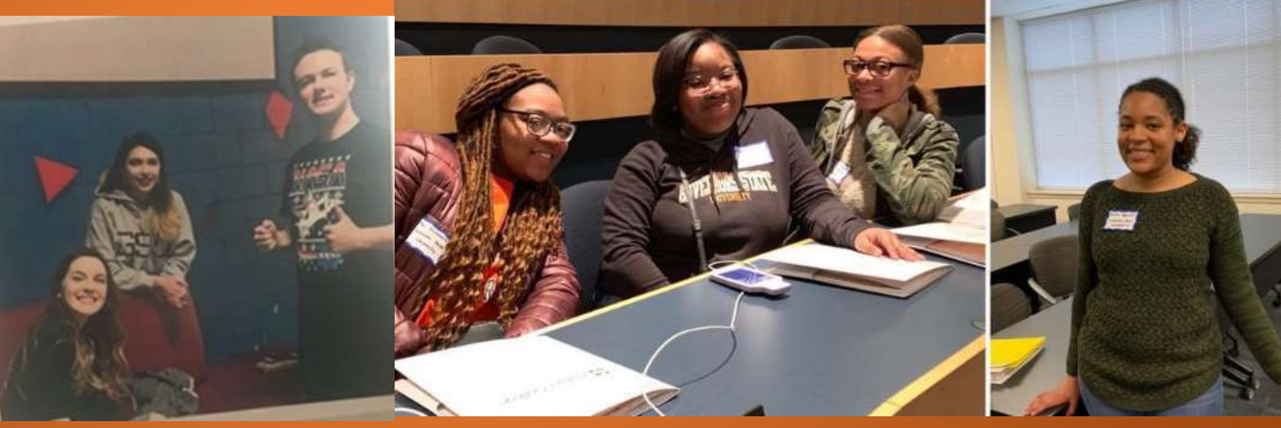
HCIR Symposium 2019 at Harper College, Palatine Illinois