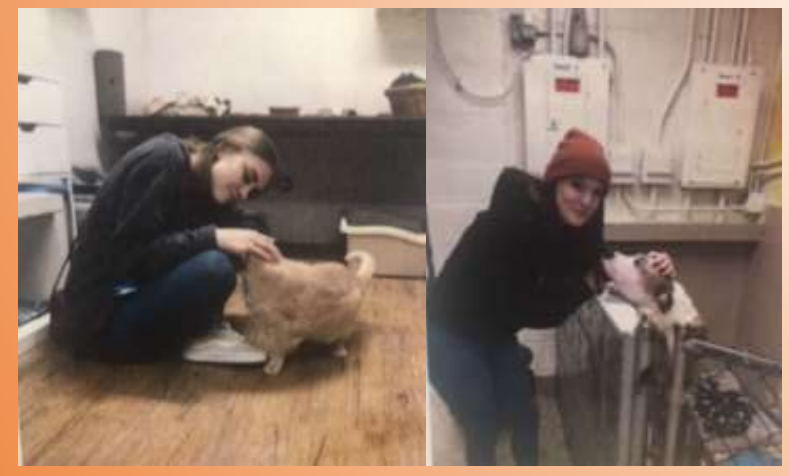
Pet Supply Drive