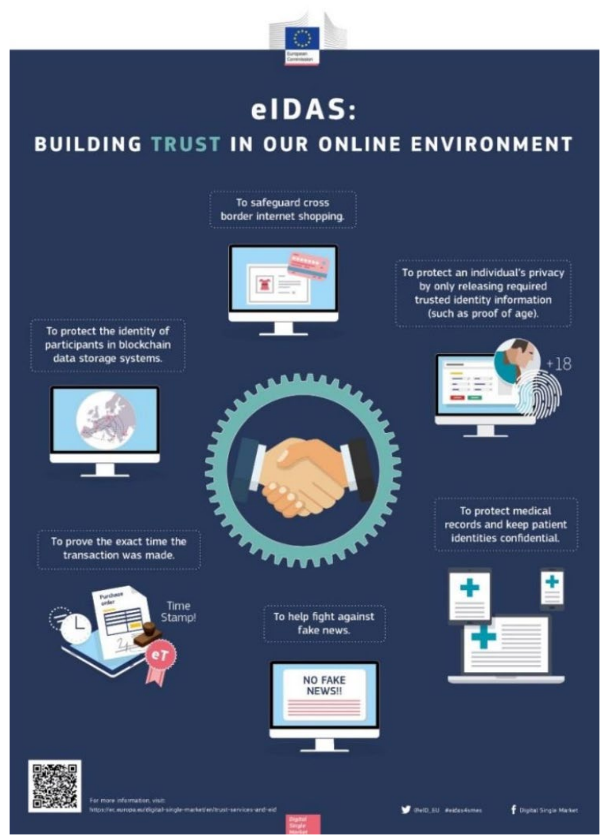
Source : "Trust in a Digital Society" (2018) presentation by Anders Gjøen DG CONNECT, European Commission Unit, eGovernment & Trust.