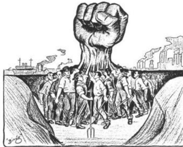
Solidarity, June 30, 1917. The Hand That Will Rule the World—One Big Union.

The folk group represented here includes all those who are oppressed, suffer from injustice, but are fighting. The folk item is the performance of the fist in the air.