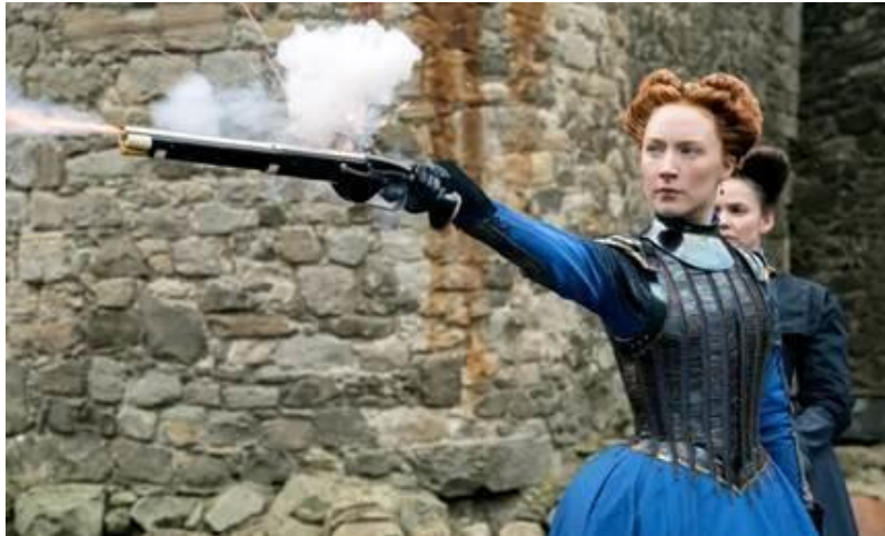
Figure 2: Saoirse Ronan as Mary Stuart in Mary Queen of Scots (dir. Rourke, 2018).

defies gendered expectations and is equally capable of ruling at court and on the battlefield.