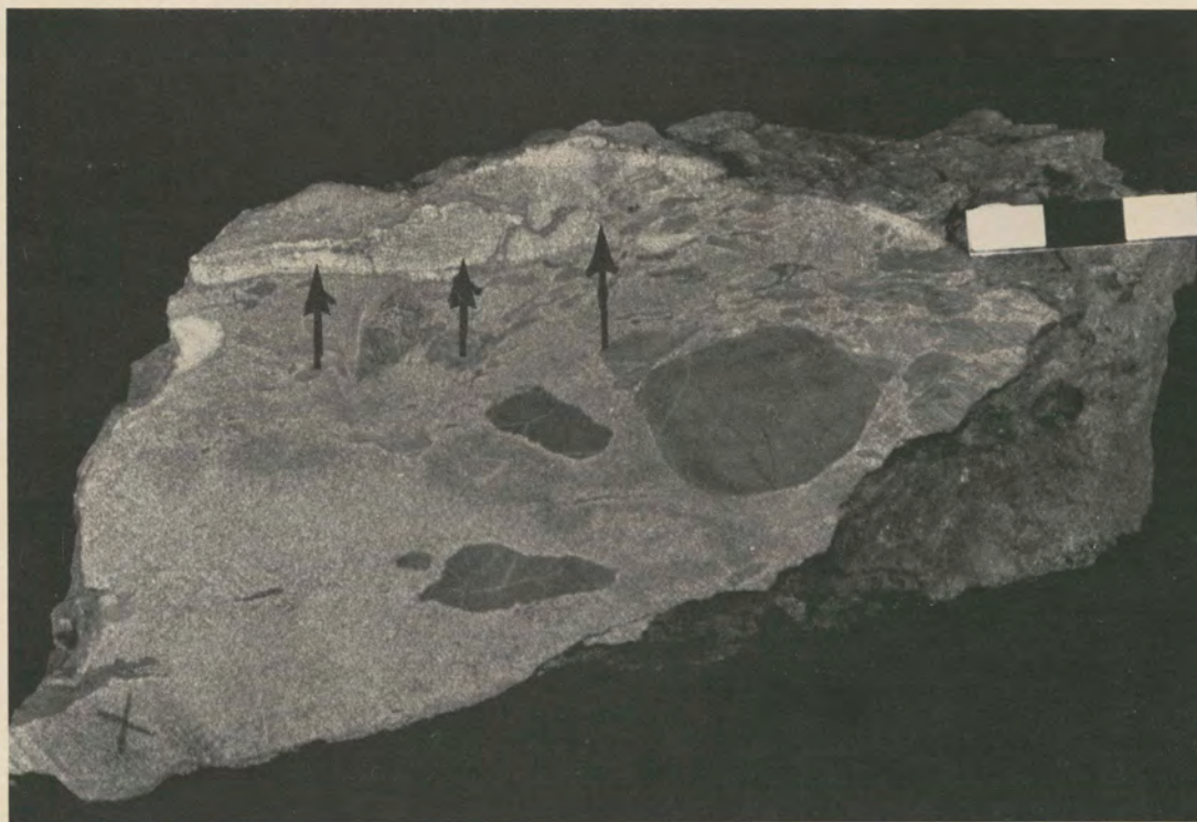
Figure 7. Block of fine-grained sandy mudstone containing irregular mudstone and fossil bone fragments from the Cynognathus zone. Arrow indicates part of the skull roof of a fossil amphibian.