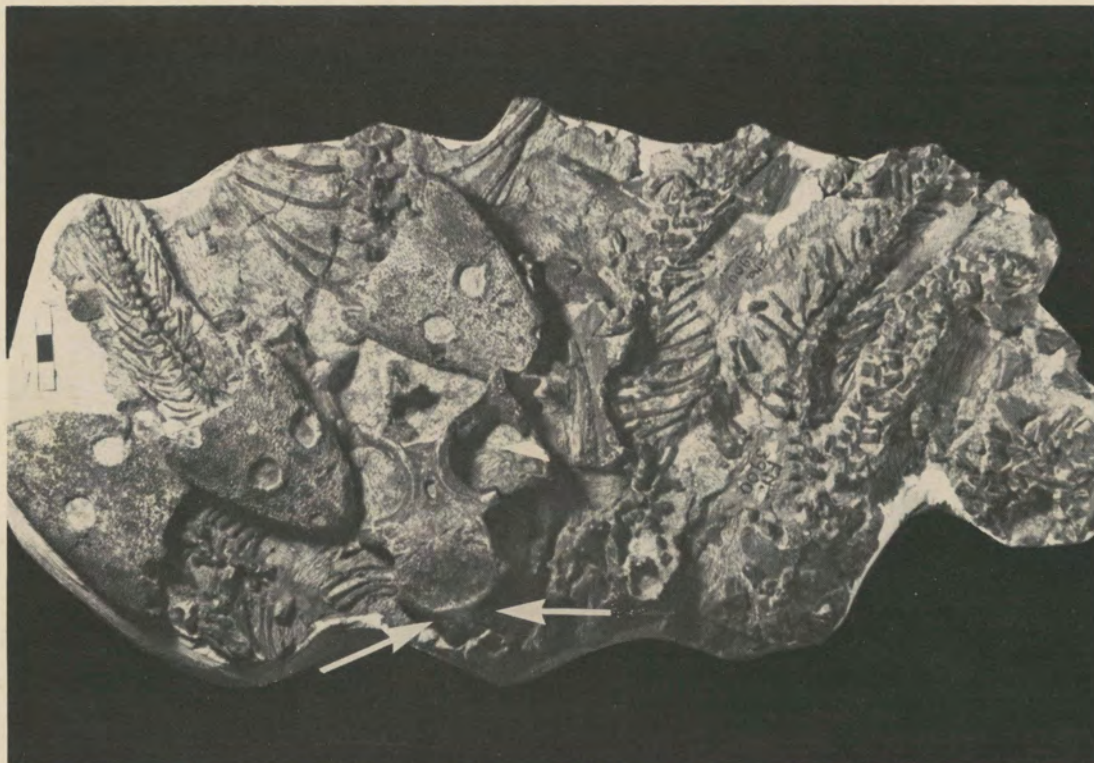
Figure 6. Block of calcareous mudstone from a small localised "pool" on the Harrismith Commonage containing the remains of seven lydekkerinids and a Lystrosaurus murrayi . Arrows indicate nasal region of the latter genus.