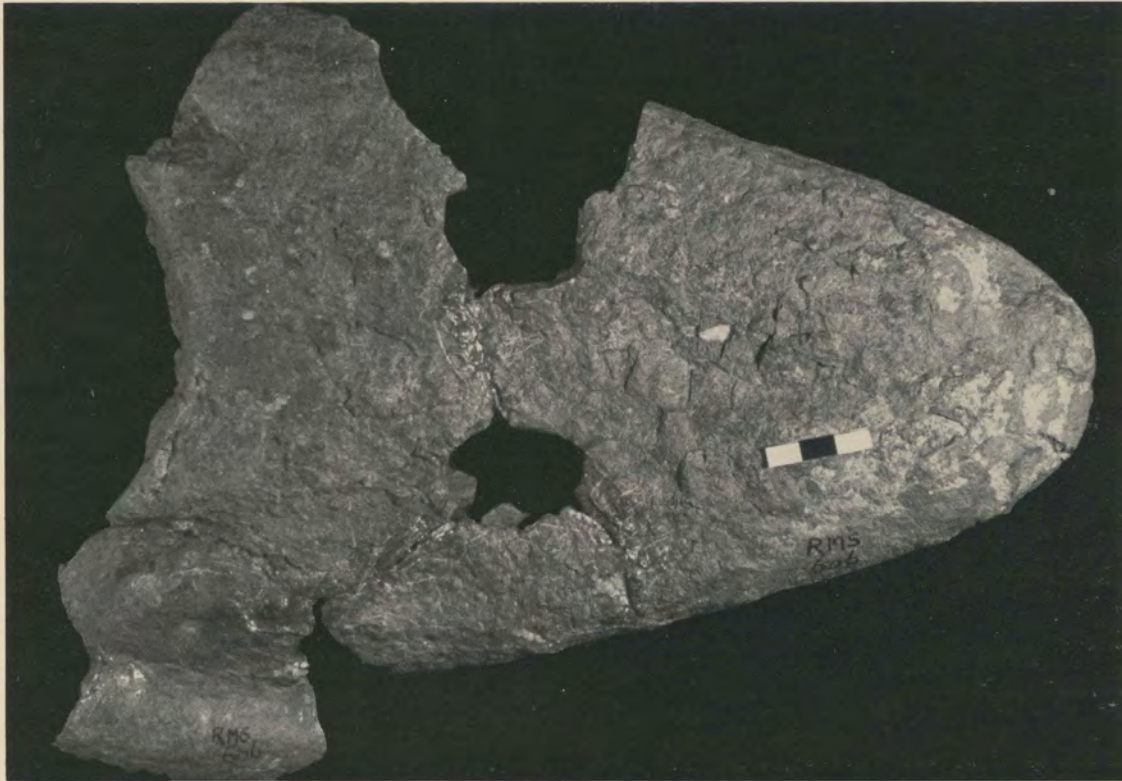
Figure 2. Dorsal view of unprepared rhinesuchid skull from the Tapinocephalus zone.