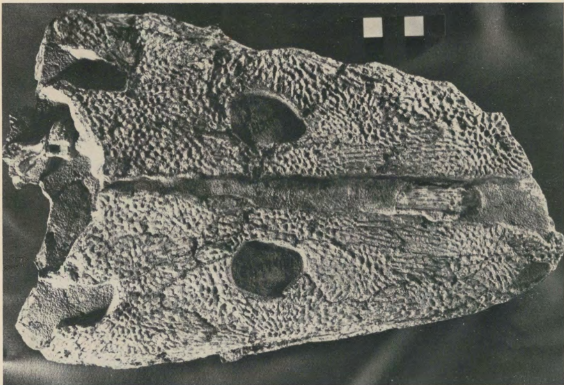
Figure 3. Dorsal view of undescribed rhinesuchid skull from the Daptocephalus zone. Note deep prefossilization crack through median suture.