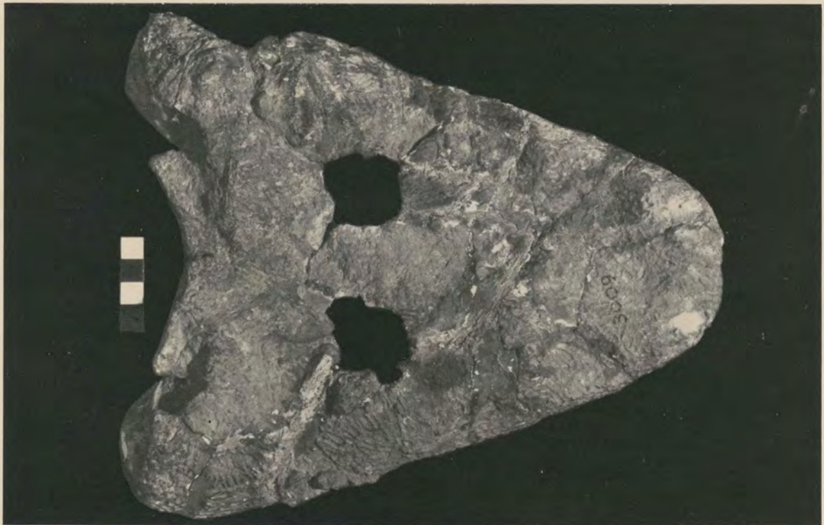
Figure 1. Dorsal view of inadequately prepared type of Rhinesuchus beaufortensis Boonstra.