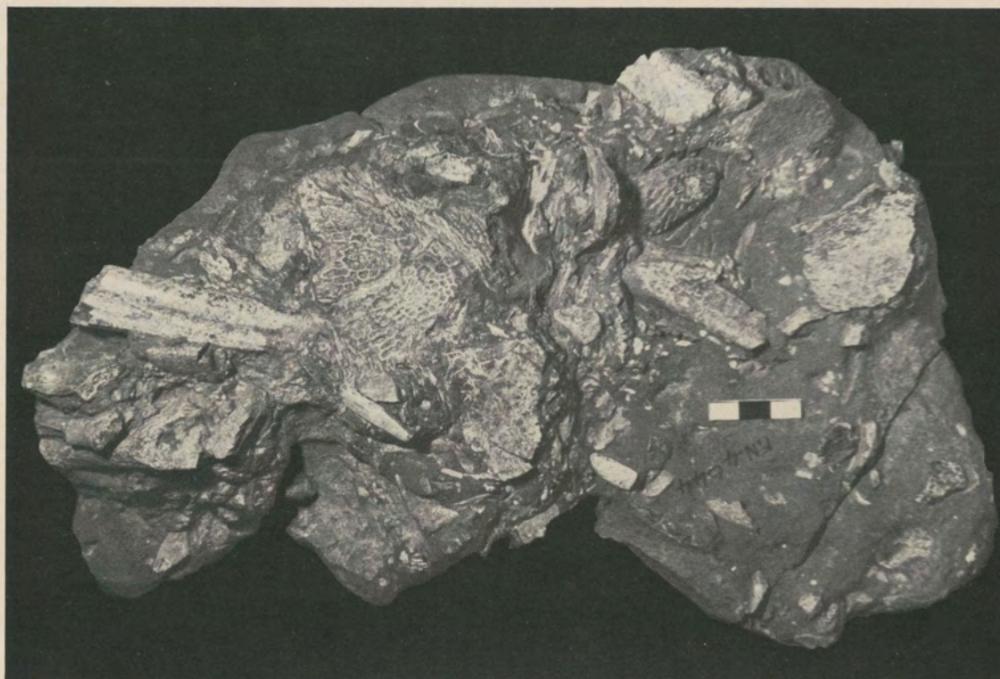
Figure 8. Block of bone conglomerate containing fossil amphibian and reptilian fragments of varying sizes and shapes from the Cynognathus zone.